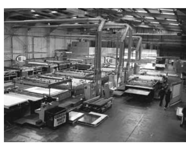
Two silk-screen printers, Capital Print and Display, 2007 Capital Print operated from Marshgate Lane and printed large-format prints and posters for hoardings.