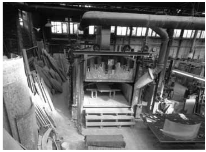
Factory floor and view of kiln, John Bowden Ltd, 2006 Established in 1800, the former John Bowden Ltd factory was situated on the edge of the Olympic site. Some kilns reach 650°C, depending on the desired curve of the glass.