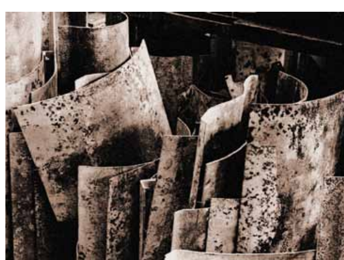
Victorian moulds for bending glass, John Bowden Ltd, 2006 Some of the moulds date back to the 1820s and would have required 20 men to lift them.