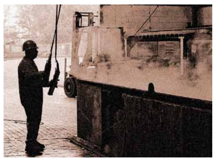
Hydrochloric acid tanks, Parkes Galvanizing Ltd, 2006 During the galvanizing process, steel is immersed into hydrochloric acid tanks and hot molten zinc at 450°C.