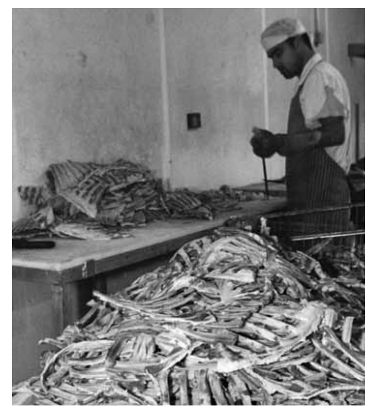
De-boning meat prior to mincing, Harringay Meat Traders Ltd, 2006 Harringay Meat Traders are wholesale butchers and doner kebab manufacturers. The company has relocated to Dagenham, Essex.