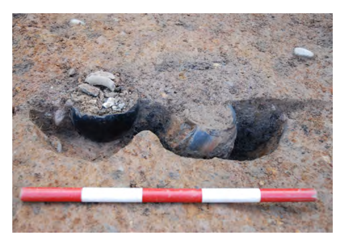
Figure 6 Roman cremation burials from Birdoswald, Cumbria.

In simple terms early Roman burials studies are dominated by cremation cemeteries that may in part reflect pre-existing insular tradition, but may also be influenced by intrusive traditions and practices. From the later 2nd century AD cremation is gradually superseded by inhumation burials as the preferred rite (Figure 5). While this is generally correct, and exceptions have been recognised by researchers for many years - for example the later survival of cremation burial in the north (Figure 6) – the picture is actually far more complex and regionally varied. The current balance of evidence is heavily weighted towards southern England and to urban cemeteries. Wiltshire appears to represent an area where inhumation was the preferred early Roman rite, perhaps reflecting localised pre-Roman preferences.