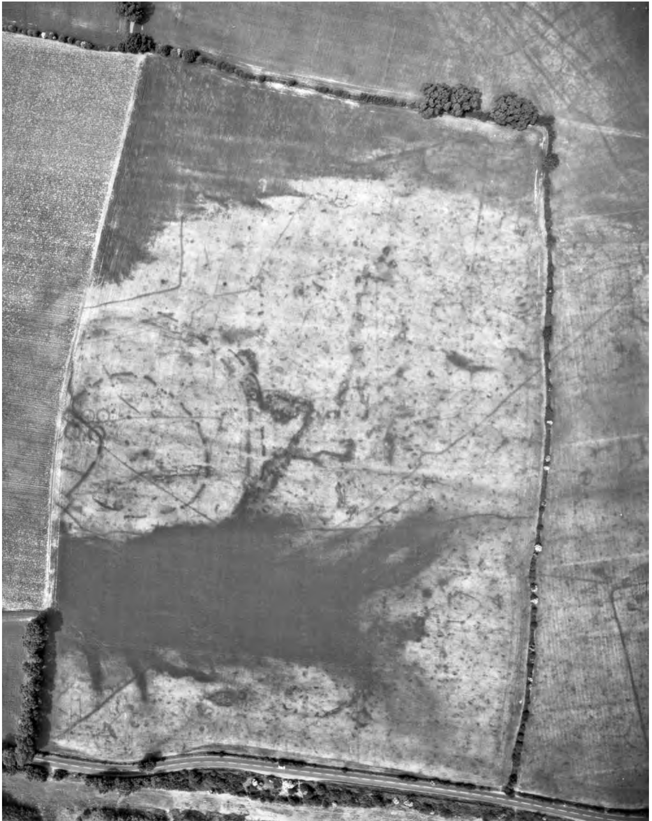
Plate XI Aerial photograph of the causewayed enclosure on a gravel terrace overlooking the Thames estuary at Orsett, Essex. The corner of an Iron Age rectangular enclosure can be seen to the left of the photograph, the group of ring-ditches are of Anglo-Saxon date. Cropmarks of a trackway and rectilinear fields/enclosures can also be seen. The existing hedgerows and sinuous road are elements of a rectilinear pattern of land division, of ancient origin, characteristic of large parts of south and east Essex. Ostensibly a photograph of a Neolithic site, the complexity revealed is typical of much of the region, and is a good example of the need to move from a site-based approach to one which considers the historic environment as a whole.

(K17-U 117, 13 June 1970)