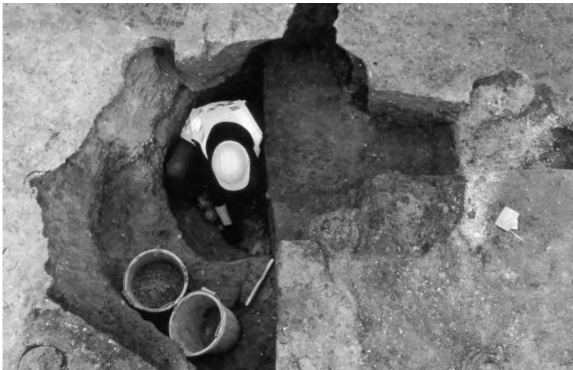
Plate VII Excavation of a complex of pits at the Millennium Library site, Norwich.

methodologies will need to engage with other studies. It is especially important that the wealth of historical data available for later medieval and post-medieval towns is complemented and, if necessary, challenged by archaeological research. Areas of such interaction should include: