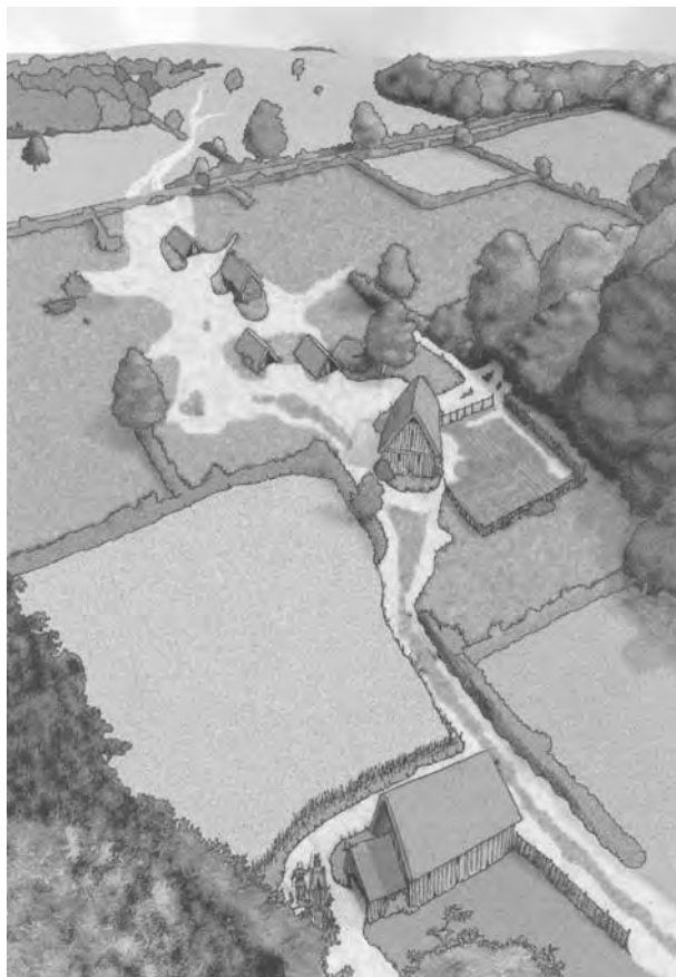
Plate VI Reconstruction of the Late Anglo-Saxon landscape around the manorial site at Hinxton Hall, Cambridgeshire. (Illustrator: Jon Cane, copyright Cambridgeshire County Council Archaeological Field Unit)