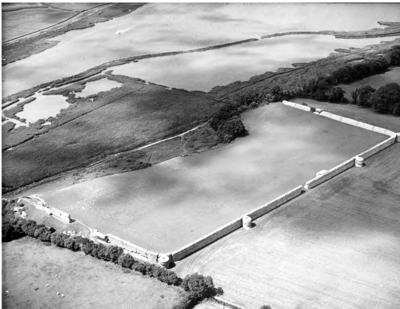
Plate IV The 'Saxon shore' fort at Burgh Castle on the Norfolk coast. (Photo: D.A.Edwards, 16 July 1984, AXK6 copyright Norfolk Museums Service)

It appears that religion is one of the easier functions to identify from surface collections (metal detecting) alone, but few of these groups have been quantified, compared or further investigated in any way.