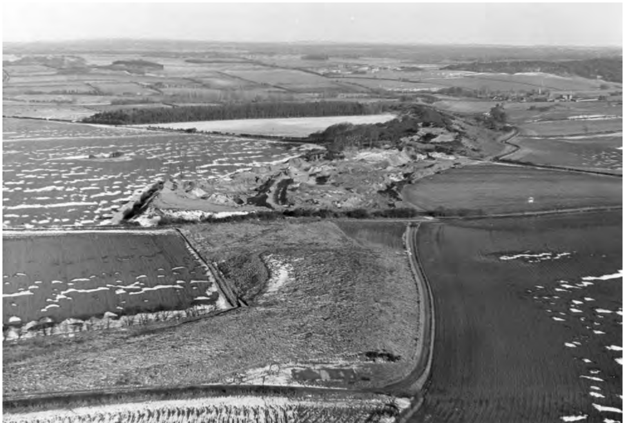
Plate I An Ice-Age feature known as the Blakeney esker, near the north Norfolk coast.