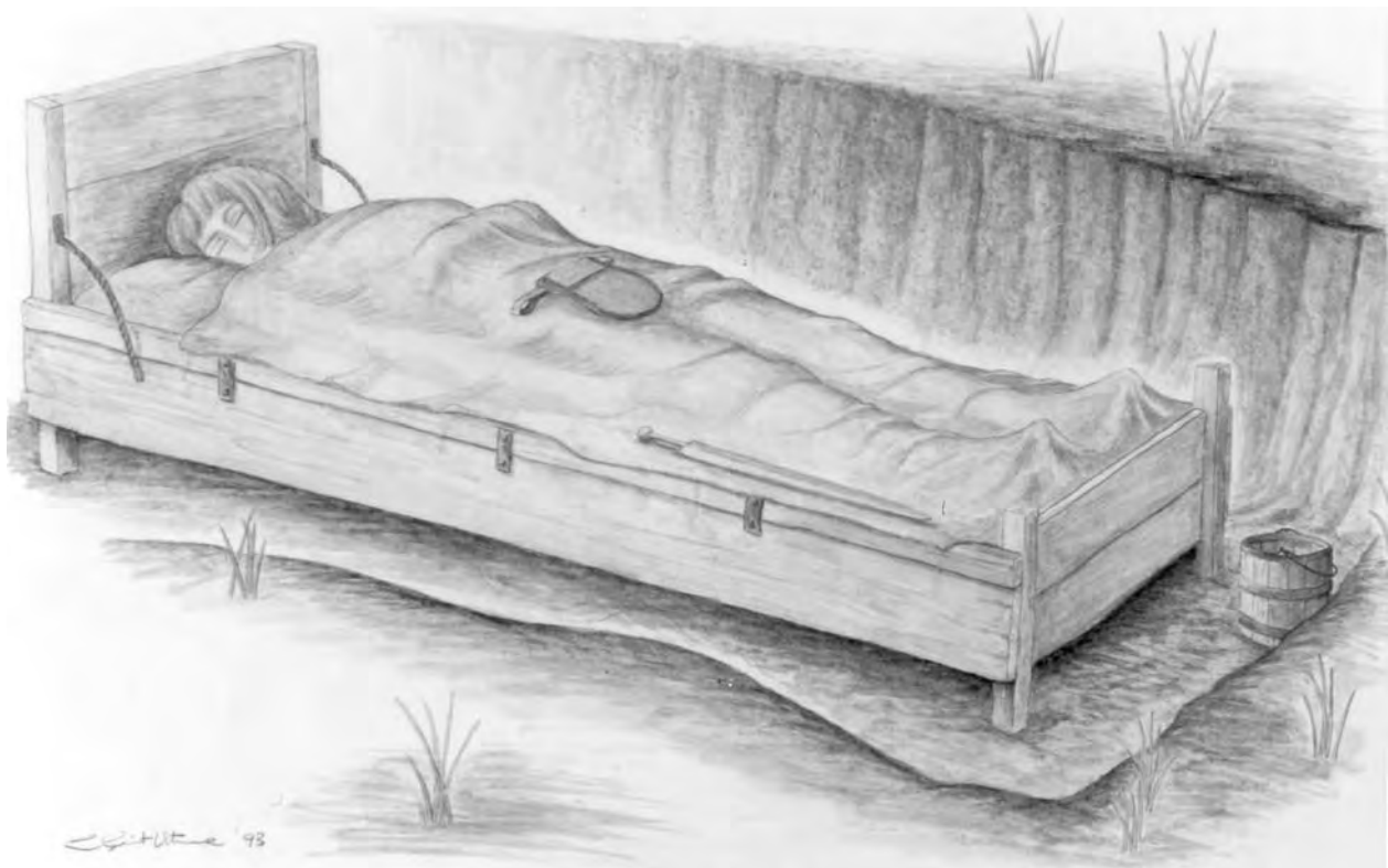
Plate V Reconstruction of a 'bed burial' excavated at Barrington Anglo-Saxon cemetery in Cambridgeshire. (Illustrator: Caroline Malim, copyright Cambridgeshire County Council Archaeological Field Unit)

change and urban growth? How is the need to generate surplus food and raw materials for craft activity reflected in the archaeological record? Is rural settlement pattern related to the need to generate surplus for urban growth?