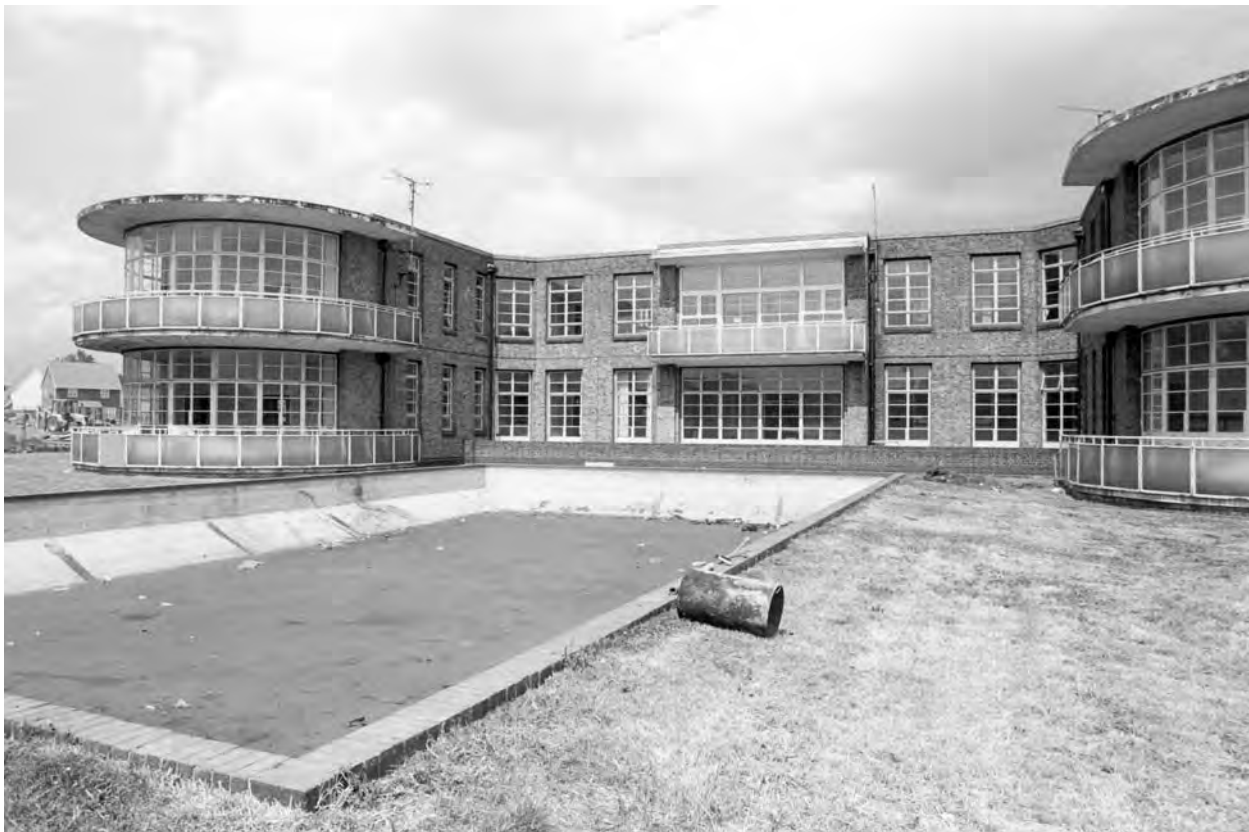
Plate X Hospitals, workhouses, prisons and schools are important but poorly studied building types. They form part of the broader industrial landscape and require investigation if the agenda is to move beyond the scope of the manufactory into a consideration of the social parameters of industrial development. Southend Municipal Hospital, Rochford, was designed in the International style and was largely complete by 1940. Highly significant in terms of hospital design, it was intended as a model complex.

limekilns (Gibson 1996), iron foundries (Garwood 1997) and Poor Law buildings (Garratt 1998); Gould (1996b) provides a summary of the methodology.