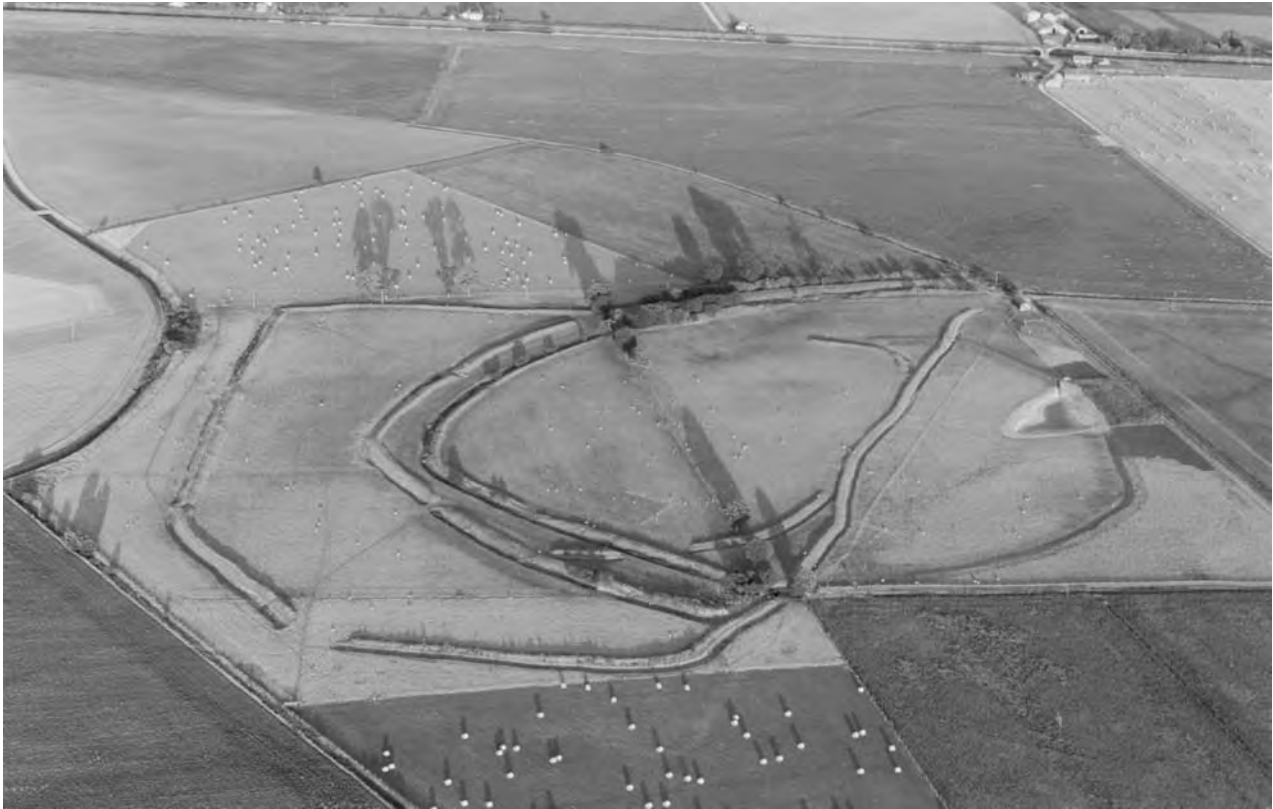
Plate III Aerial view of the earthworks at Stonea Camp near March, Cambridgeshire. Built by the Iceni on an island in the Fens, this is Britain's lowest-lying Iron Age fort at only 2m above sea level.

The potential value of quantified assemblages is probably greatest for the later Iron Age where quantification could substantially improve our understanding of the chronology and relative importance of imports and the introduction of wheel-thrown pottery. The lack of quantification for the earlier Iron Age also adds to the general problem of making intra-site comparisons caused by the difficulties of dating earlier Iron Age assemblages in the region (see above).