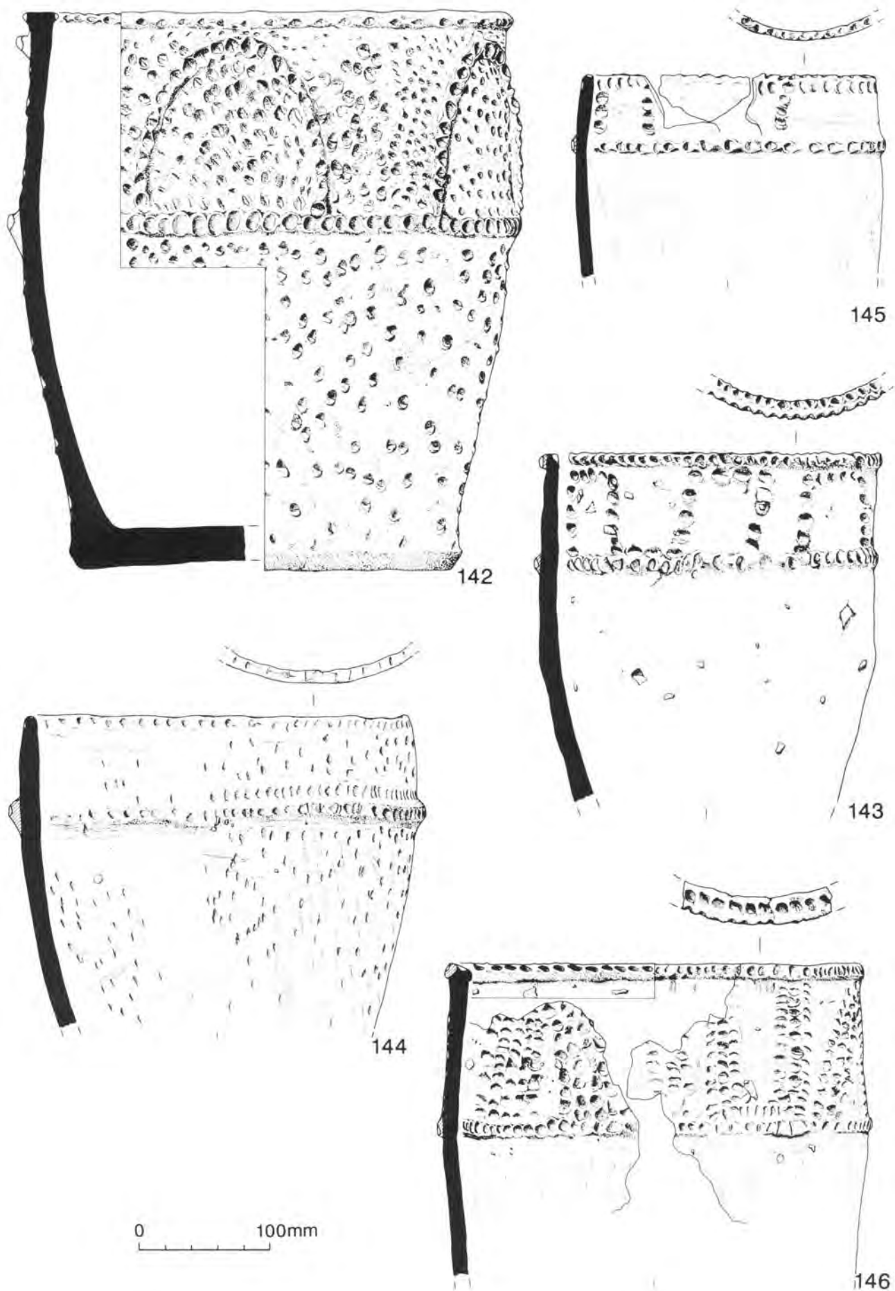
Plate II Ardleigh style pottery from a cemetery at White Colne, Essex. The distribution of this very characteristic pottery covers only a part of the eastern counties. In artefact studies, as with much else, it is important to be aware of variation within and beyond the region. ( Illustrator: Sue Holden )