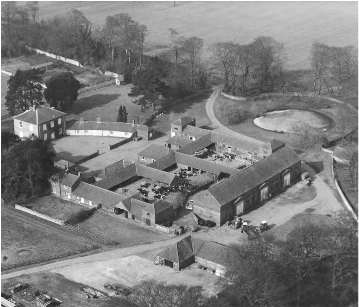
Plate IX Leicester Square Farm, South Creake, Norfolk. Designed by Samuel Wyatt and built by Thomas Coke on the Holkham estate in the 1790s.

surveys which state that they draw only on documentation that is 'readily available'). A continuing aim will be to reconstruct and understand the form and history of individual parks and gardens, and classes of parks and gardens. A long-lived park and garden is usually an historical composite, as explained above. Study may require non-invasive fieldwork (such as topographical survey, botanical or geophysical survey), and intervention on the ground (especially archaeobotanical, ecological and environmental study), as well as documentary research. An archaeological contribution is most apt in the case of obtaining, sorting and evaluating evidence for date, successive phases of use, sampling, making deductions from fragmentary evidence and reconstructing previous plans, comparing physical with documentary evidence, and providing data in the absence of documentation.