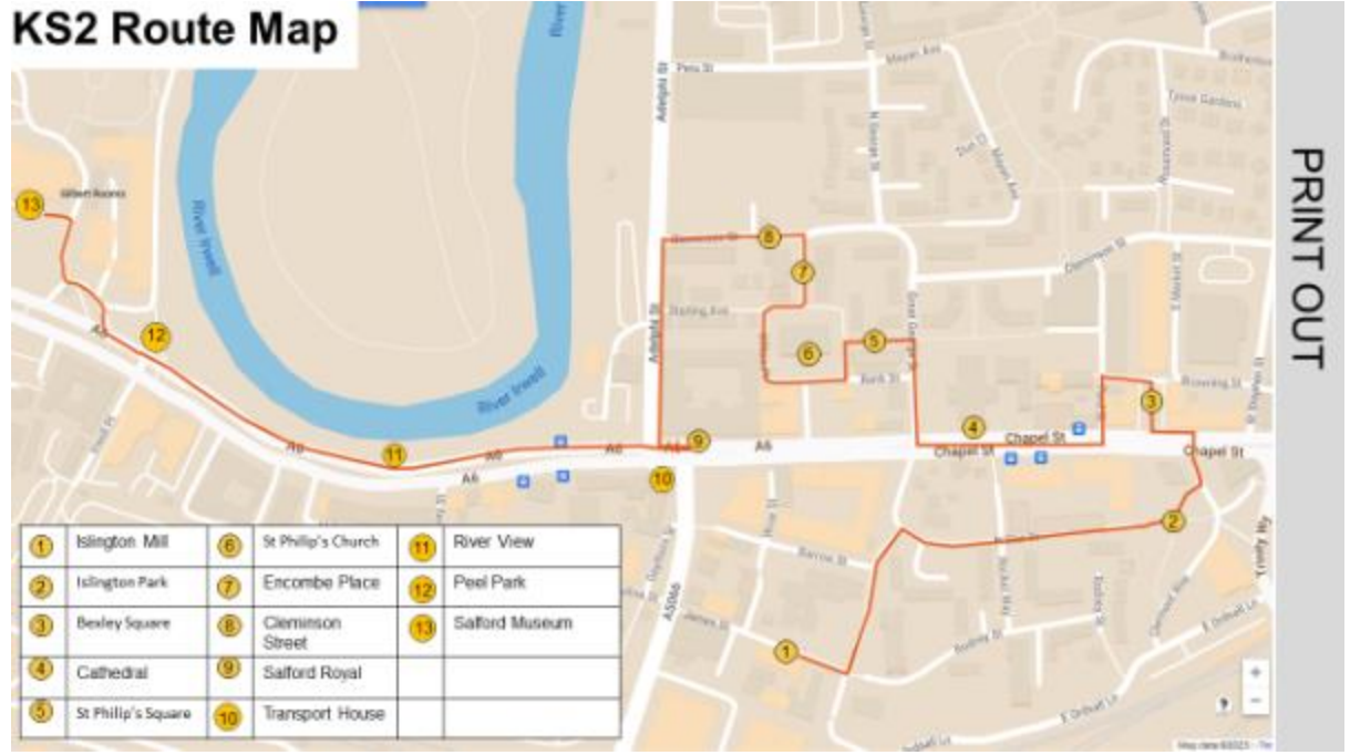
Maps of the Salford History Walks

The LHEM created a teacher's resource with additional material such as historic photos and maps. It included activities to do on the walk, in the classroom, and for children to do with their families another time. An accompanying <u>StoryMap</u> resource enables pupils to remember the location of sites and revisit them in class, or to find out about them if they cannot physically go on the trail.