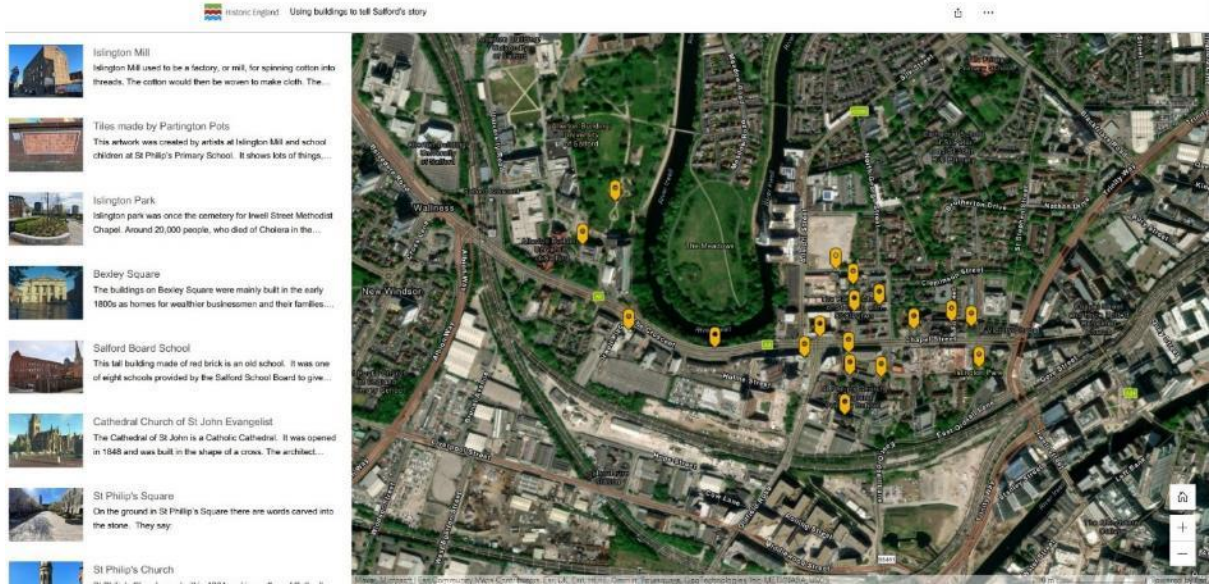
Screenshot of the StoryMap

To celebrate the launch of the resources, each class worked with artists from Islington Mill (a former cotton mill, now used as artists' workspaces), using screen printing to create banners about the local history around the school. The mill is opposite the school and the school has worked with artists on various projects over several years.