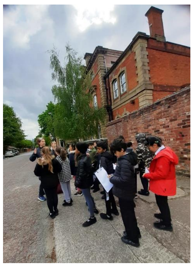
Pupils with the Guide on the History Walk

"We did Islington Mill in History, but [the Guide] told us a lot more" - Key Stage 2 pupil