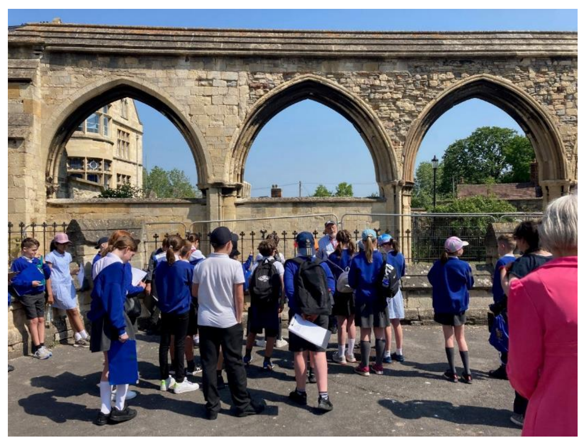
Pupils took down notes and ideas during their walking tour

Volunteer tour guides from Gloucester Civic Trust provided a 90-minute tour and told the pupils about the history of the gateway and street that they have been selected to study, and then took them on a walking tour of the city centre to highlight other buildings and features. Pupils asked the guides lots of questions throughout.