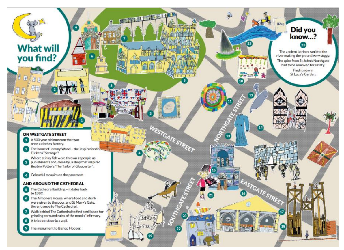
The final leaflet highlighting the history and heritage of Gloucester