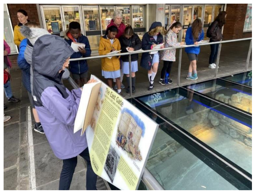
Pupils looking and learning about what remains of the Roman East Gate – they also had special access to the ruins below ground level

They were also accompanied by an artist, Catherine Hawkridge, who got the pupils to stop at various points to undertake some observational drawings. These sketches and notes were then used in the afternoon session.