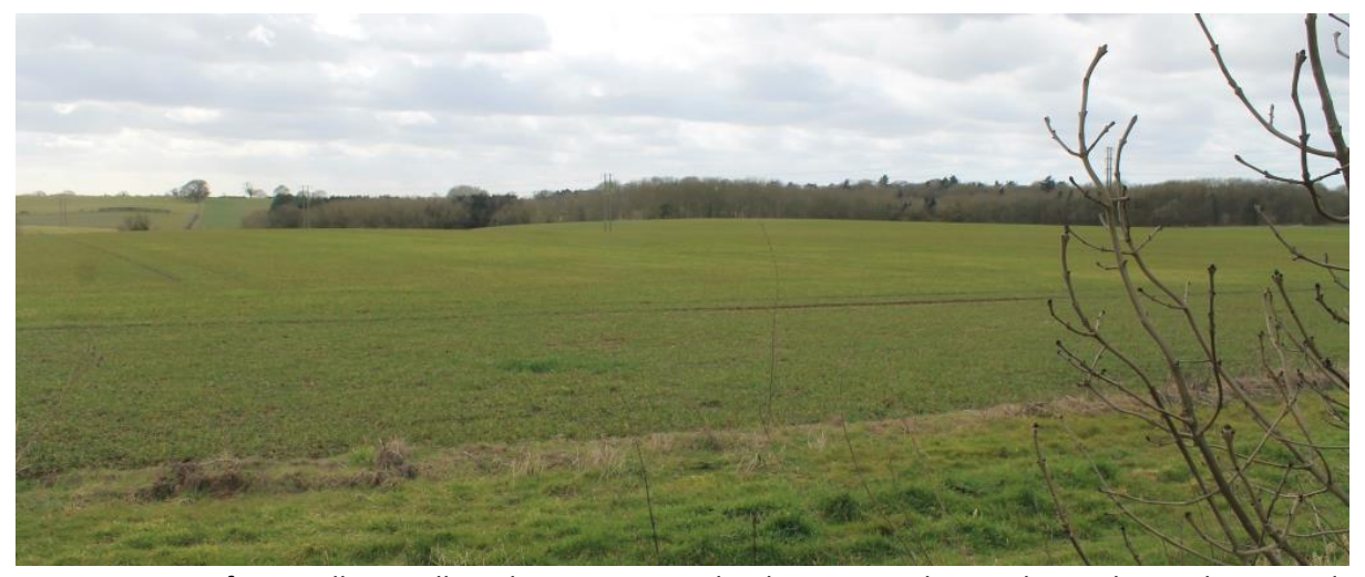
Fig. 8 View SW from Gallows Hill to The Asps site in the distance, with trees lining the Banbury Road

(ii) The Revised Development Strategy (June 2013) retained the allocation South of Gallows Hill but omitted The Asps site. Instead it allocated a large site south of Harbury Lane (the south-eastern extension of Gallows Hill), at Lower Heathcote Farm and Grove Farm. This site, 2.5-4.5km distant from St Mary's Church, could accommodate 1,300 dwellings, but due to its proximity to Bishop's Tachbrook village and plateau position would need substantial landscape buffering on its south side. Part of the site is Grade 2 farmland.