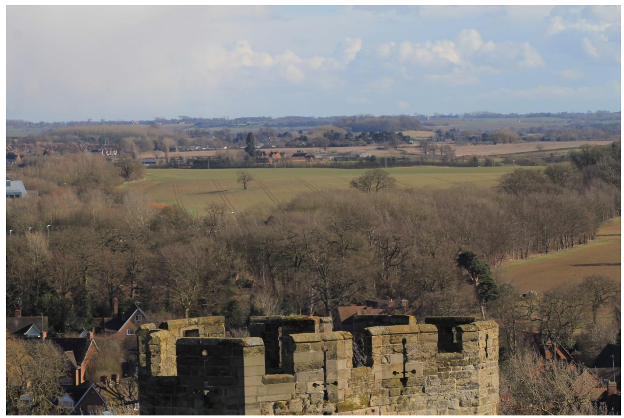
Fig. 6 South of Gallows Hill site from Guy's Tower, Warwick Castle (Banbury Rd tree screen to right)

(i) The Preferred Options (May 2013) proposed to allocate principally two adjacent sites known as 'South of Gallows Hill' and 'The Asps'. Both these sites have their western boundaries on the Banbury Road and both have their eastern boundaries on Europa Way (A452). The northern site, South of Gallows Hill (Figures 6 and 7), would fill in the land between the Technology Park and the Banbury Road, on ground rising away from the town. The southern site, The Asps would extend the South of Gallows Hill site to fill in the whole area between Banbury Road (A426) and Europa Way (A452) further south (part in Figure 8).