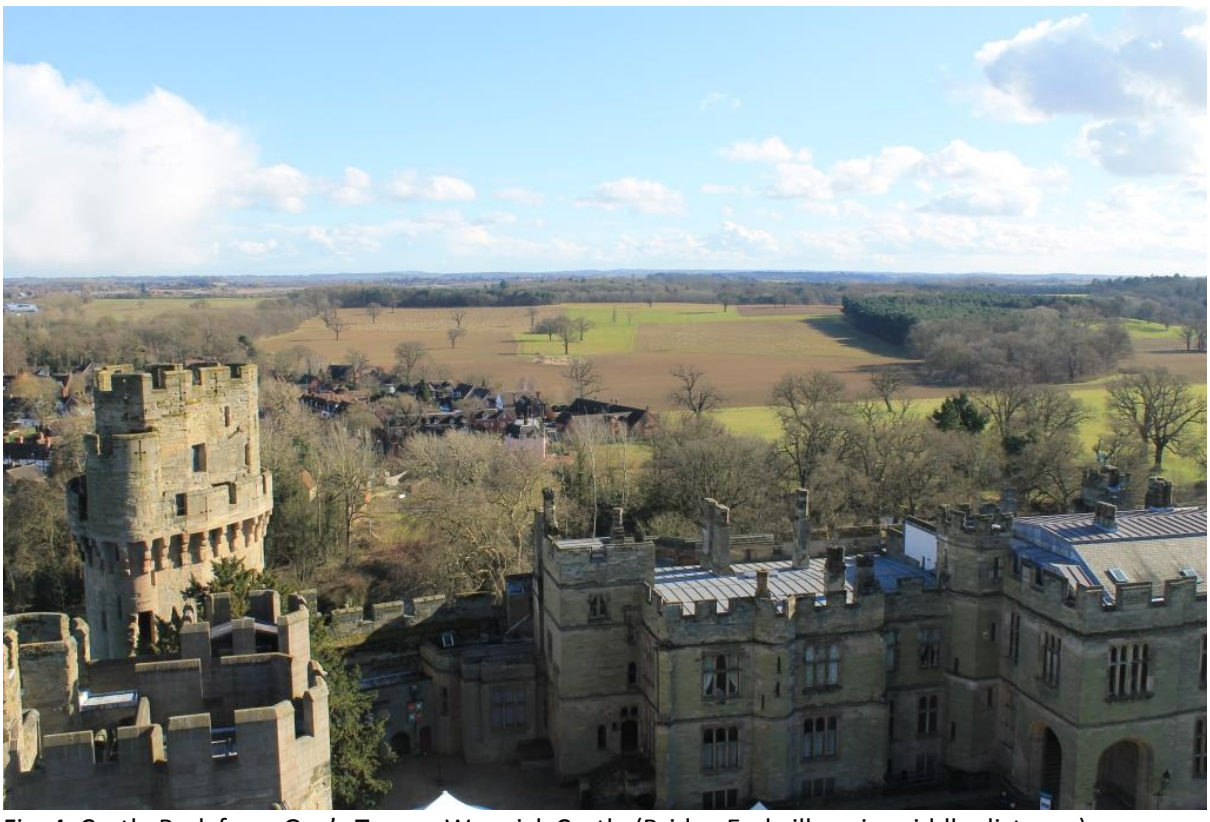
Fig. 4 Castle Park from Guy's Tower, Warwick Castle (Bridge End village in middle distance)