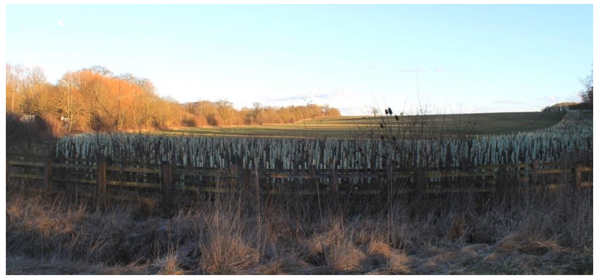
Fig. 7 South of Gallows Hill site looking south-east (Technology Park behind screening on left)

(ii) The Revised Development Strategy (June 2013) retained the allocation South of Gallows Hill but omitted The Asps site. Instead it allocated a large site south of Harbury Lane (the south-eastern extension of Gallows Hill), at Lower Heathcote Farm and Grove Farm. This site, 2.5-4.5km distant from St Mary's Church, could accommodate 1,300 dwellings, but due to its proximity to Bishop's Tachbrook village and plateau position would need substantial landscape buffering on its south side. Part of the site is Grade 2 farmland.