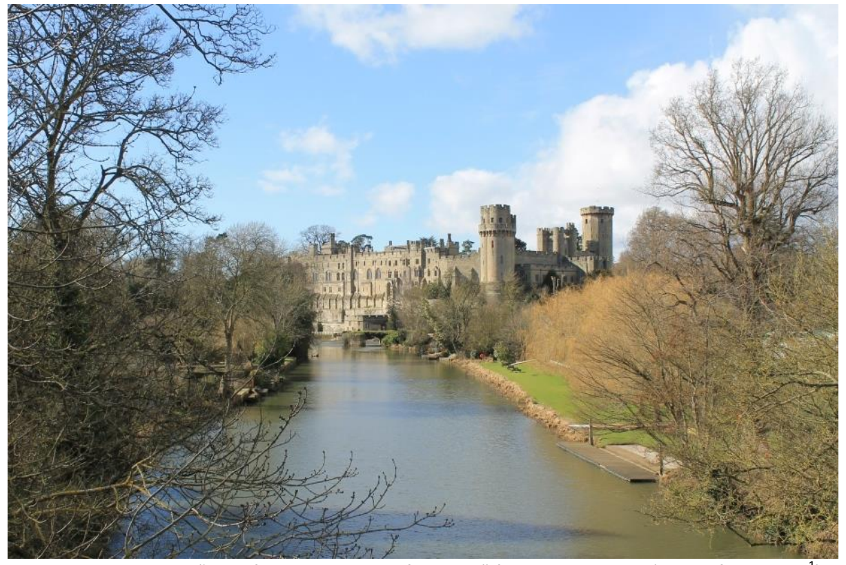
Fig. 1 Warwick Castle: "one of the great sights of England" from Castle Bridge (Alec Clifton-Taylor<sup>1</sup>)

Warwick is a town of 31,000 people on the River Avon, now largely joined to Royal Leamington Spa to its east. Nikolaus Pevsner describes Warwick in the 'Buildings of England' series for Warwickshire (1966) as "a perfect county town", which "is a case of ideal co-existence between two outstanding visual treasures" – Warwick Castle and the town itself. The Castle competes with Windsor to be the finest mediaeval castle in the land, and is certainly a hugely impressive structure (Figure 1). After a major fire in 1694 which wiped out most of the mediaeval timber-framed buildings in the town centre, Warwick was rebuilt in stone and brick on the original street pattern. Daniel Defoe is quoted as writing in 1716 "Warwick is now rebuilt in so noble and beautiful a manner that few towns in England make so fine an appearance" <sup>1</sup>, a view many will share today (Figure 2).