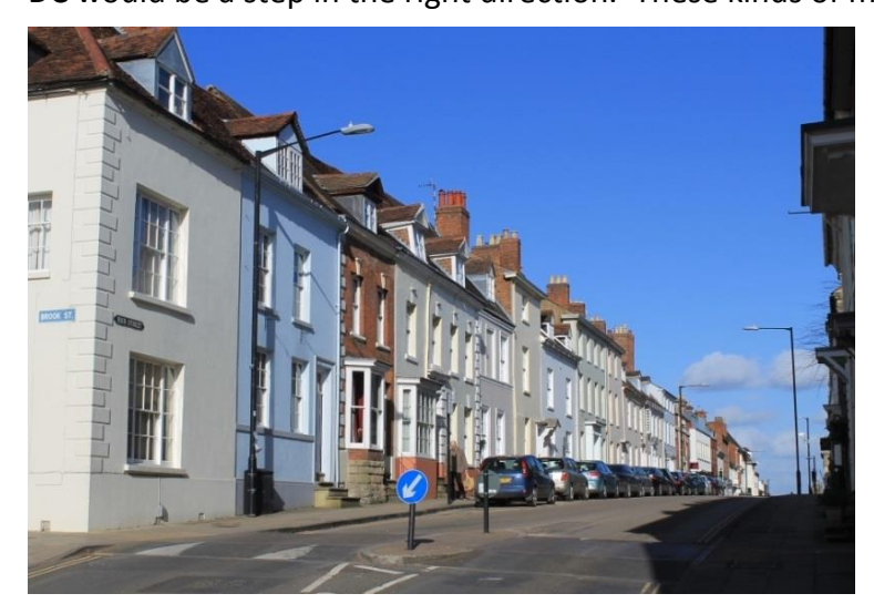
Fig. 11 Warwick High Street

A study commissioned by Warwickshire County Council from Atkins<sup>2</sup> does begin to address modal shift from car to cycling, walking and buses (and these also improve journey times), though it does not consider radical options. A positive response to this advice by Warwick DC would be a step in the right direction. These kinds of measures understandably raise