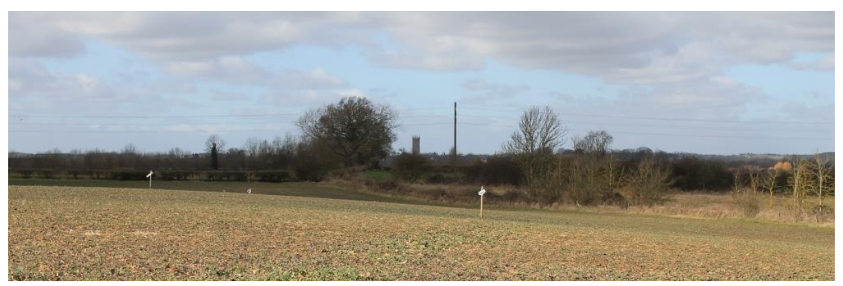
Fig. 5 Myton Garden Suburb site west of Europa Way, with St Mary's Church tower 2.5km distant

completely screened from Warwick town centre but visible from the towers of St Mary's Church and the Castle (Figure 5). The other allocations have been as follows: