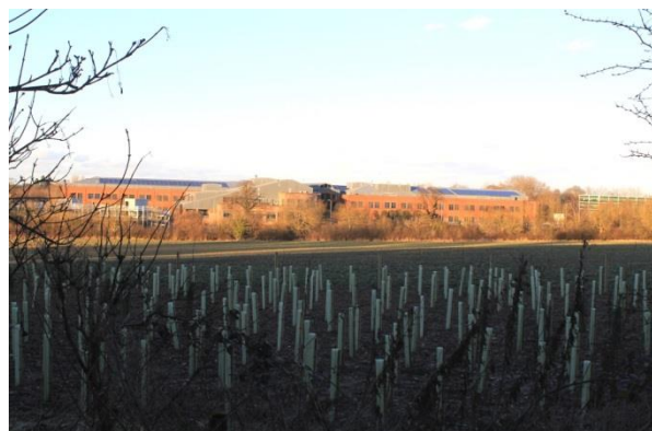
Figs. 9 and 10 Tree screening beside Banbury Road: to the Castle Park and South of Gallows Hill site