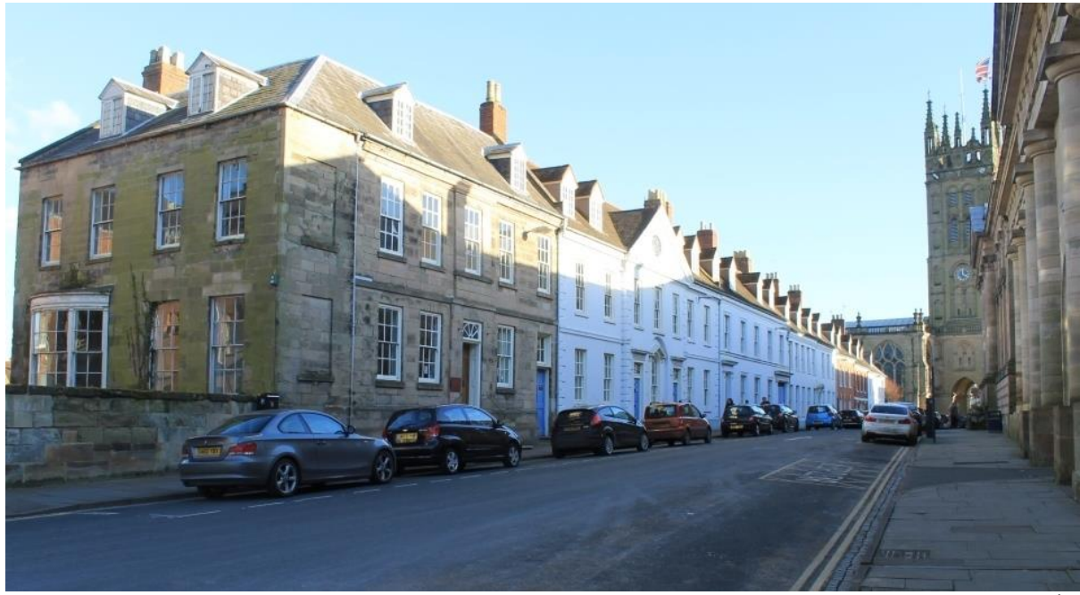
Fig. 2 Northgate Street: "the most handsome Georgian street in the Midlands" (Alec Clifton-Taylor<sup>1</sup>)

The town grew up predominantly on the north bank of the River Avon, out of the flood zone, while the Castle estate controlled a swathe of land on the south bank as a Castle Park. In 1793 the Earl of Warwick built a new bridge over the river to take the Banbury Road (as