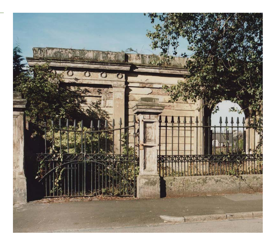
Figure 5: Neo-classical frontage to Deane Road Jewish cemetery, Liverpool. Photographed in 2002, prior to restoration.

Towards the end of the Georgian era, the overcrowded and insanitary state of England's urban burial grounds reached a critical point. 'Miasmas' from rotting corpses were identified as a major cause of disease. In the 1850s, a series of Burial Acts forced the closure of many urban graveyards, including several of the earliest Anglo-Jewish burial grounds in London and East Anglia. A new model for burial provision was pioneered by joint-stock companies, who opened a series of grand and picturesque suburban cemeteries in the 1830s and 1840s. The unusually elaborate Greek revival style entrance to Liverpool's Deane Road Jewish cemetery (1836) reflects these new styles in cemetery design.