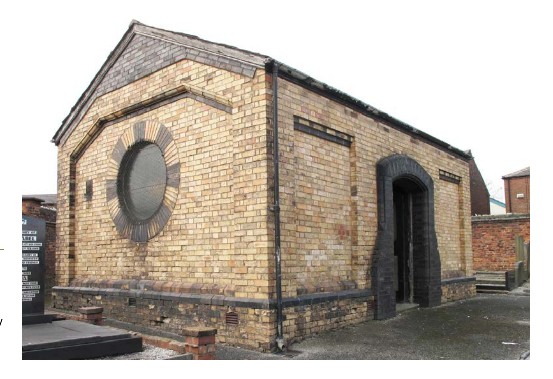
Figure 2: Ohel at Manchester Reform Cemetery, probably built between the 1860s and 1880s.