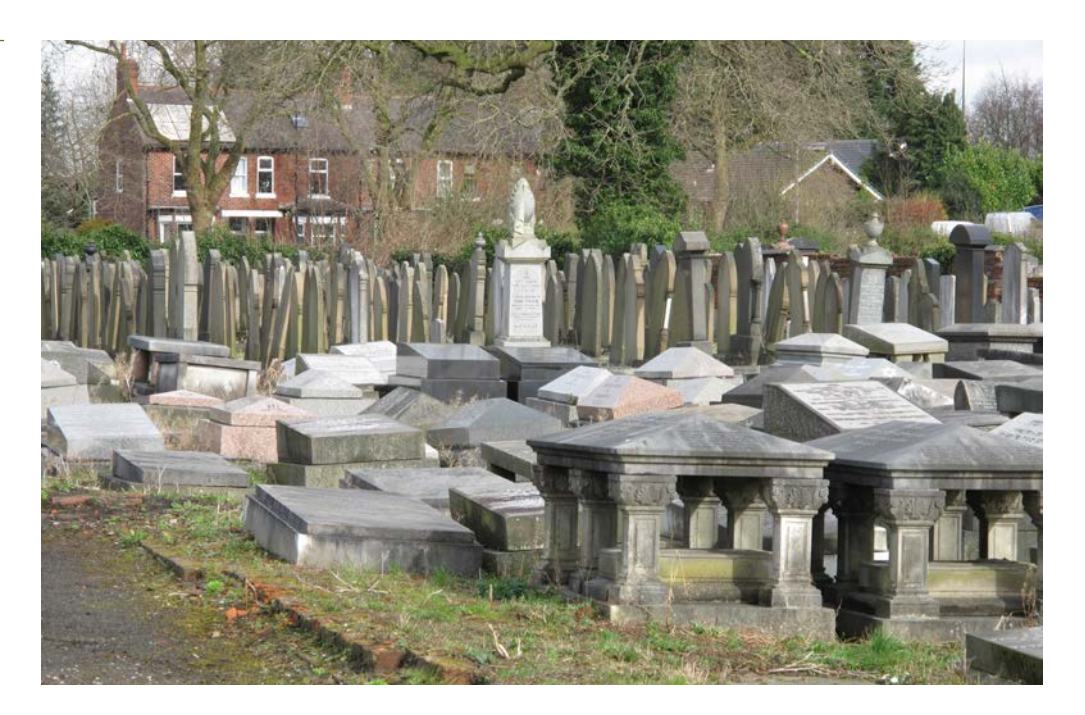
Figure 1: Sephardi tombs with Ashkenazi headstones in the background, Urmston Jewish Cemetery, Manchester.

Marking a grave, while common today, is not essential according to Jewish relegious law and is not universal practice. Upright headstones (matzevot) of the Ashkenazi tradition are most commonly found in Anglo-Jewish cemeteries, reflecting the Central and Eastern European origins of the vast majority of Britain's Jewish population. Sephardi burial grounds have graves marked by false sarcophagi. Tombs of notable scholars and rabbis may be covered with more elaborate structures. Whatever their form, modest and understated tombstones are encouraged, in keeping with the Jewish belief that all should be equal in death. Ornamental planting and laying of floral tributes is not Jewish practice and figurative sculpture is not permitted because of a fear that it may lead to idolatry. In Liberal and Reform cemeteries such restrictions are sometimes less prescriptive.