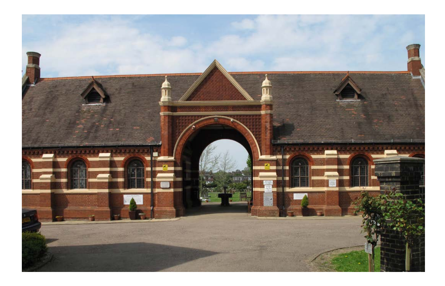
Figure 9: Prayer halls, Hoop Lane Cemetery, London, erected for the cemetery's opening in 1896.