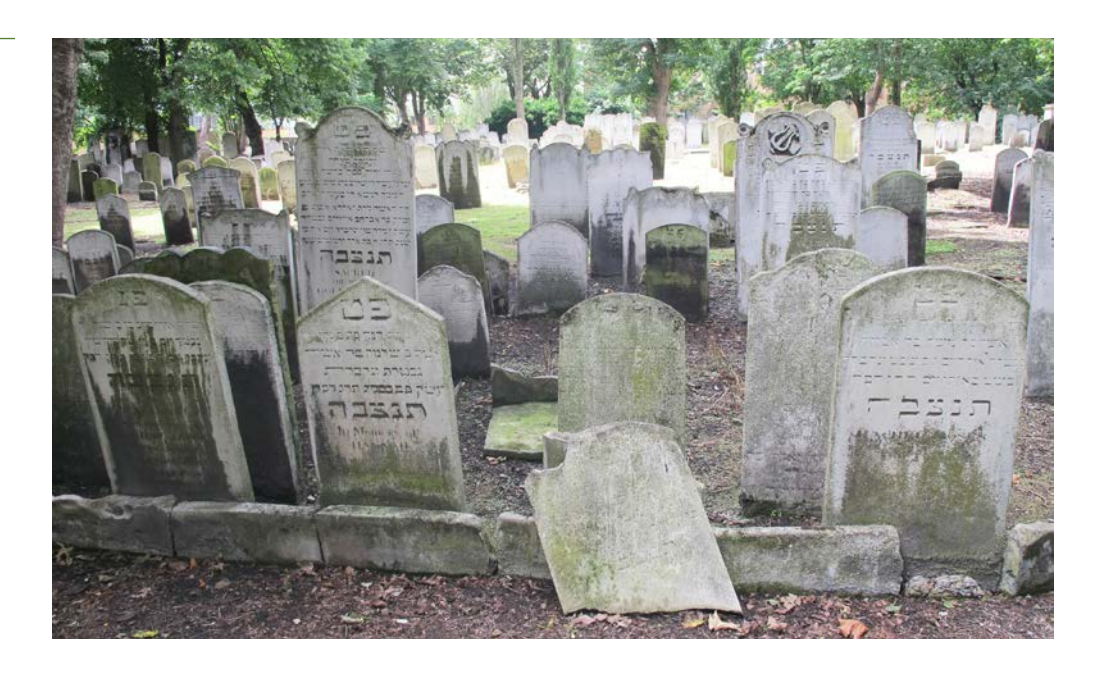
Figure 4: Multiple headstones marking layered burials at Brady Street Cemetery, London.

As the Jewish population increased these small burial grounds struggled to accommodate growing numbers of burials. Paths were turned into extra burial space and, despite a religious stipulation that interments should be at least six hand breadths apart, graves were packed together tightly. Where possible, burial grounds were extended, but this was not an option for those hemmed in by development. The solution to the problem at the Great, New and Hambro' Synagogues' shared burial ground in Brady Street, London, was to pile earth over existing graves to accommodate further layers of burials, a practice common in Eastern and central Europe, but rare in Anglo-Jewish cemeteries.