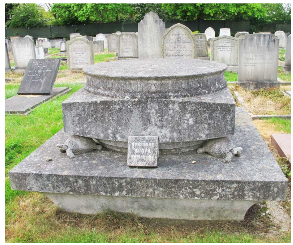
Figure 12 (left): The grave of Conchita Supervia (d.1936), Willesden Liberal Jewish cemetery, London.