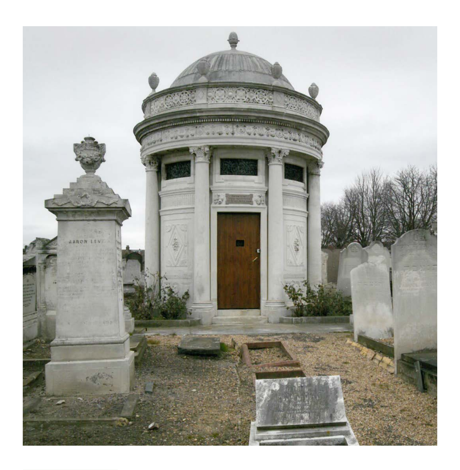
Figure 7: Rothschild Mausoleum, West Ham Jewish Cemetery, London.

In a further break with tradition, large and impressive monuments were adopted by wealthy and successful Jews. They included fashionable forms common in contemporary Christian cemeteries and a number of finely crafted bespoke tombs. Jewish families who were patrons of the arts and moved in artistic and literary circles were able to enlist the services of leading designers. They included Max Eberstadt (d1891), whose tomb in Willesden's United Synagogue cemetery was designed by family friend Edward Burne-Jones. The neo-classical Rothschild Mausoleum (1866) in West Ham Jewish cemetery, London, was designed by Sir Matthew Digby Wyatt. Although their designer is unknown, the Rothschild family's burial enclosures and tombs in the United Synagogue's Willesden cemetery are equally fine. They lie in close proximity to an imposing 'classical temple' over the graves of the Samuel family, jewellers who went on to found H Samuel jewellery shops.