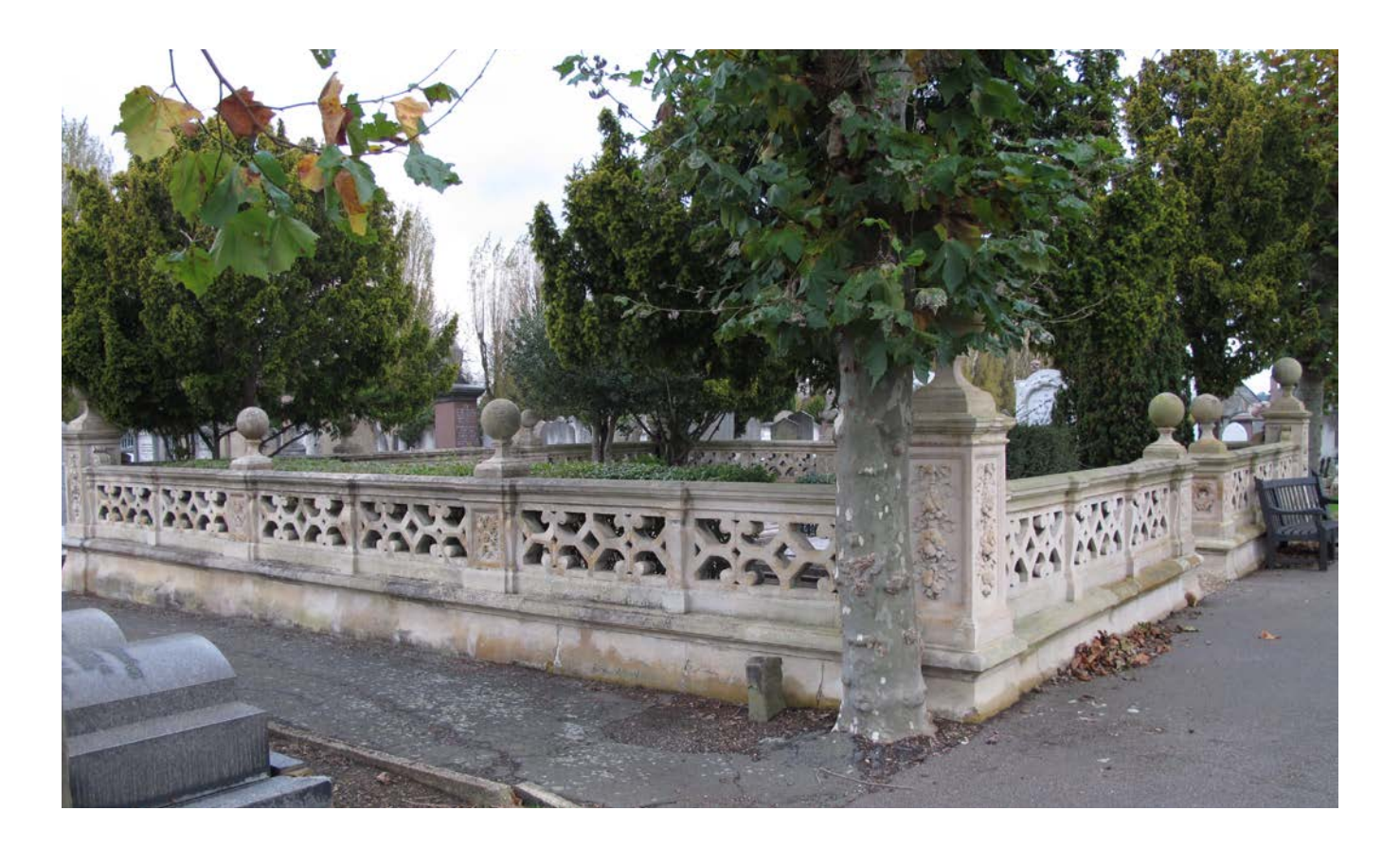
Figure 6: One of several Rothschild family enclosures in the United Synagogue cemetery, Willesden.

Established as functional spaces, Victorian Jewish cemeteries lack the ornamental landscaping seen in many non-Jewish contemporary cemeteries. The majority consist of open expanses of grave plots subdivided by grids of paths, the layout of which is almost always based upon a central avenue leading through the burial area from the Ohel. The main avenue is often tree-lined, but ornamental trees and elaborate planting schemes are generally absent. Sub-divisions are rare but a few cemeteries, such as the United Synagogue and Liberal cemeteries at Willesden, contain small hedged or walled enclosures which serve as 'garden rooms' containing the graves of individual families. During this period Jewish burial grounds become more visible than previously, furnished with imposing entrance fronts such as the ornate wrought iron entrance gates and double prayer hall complex at Hoop Lane, Golders Green.