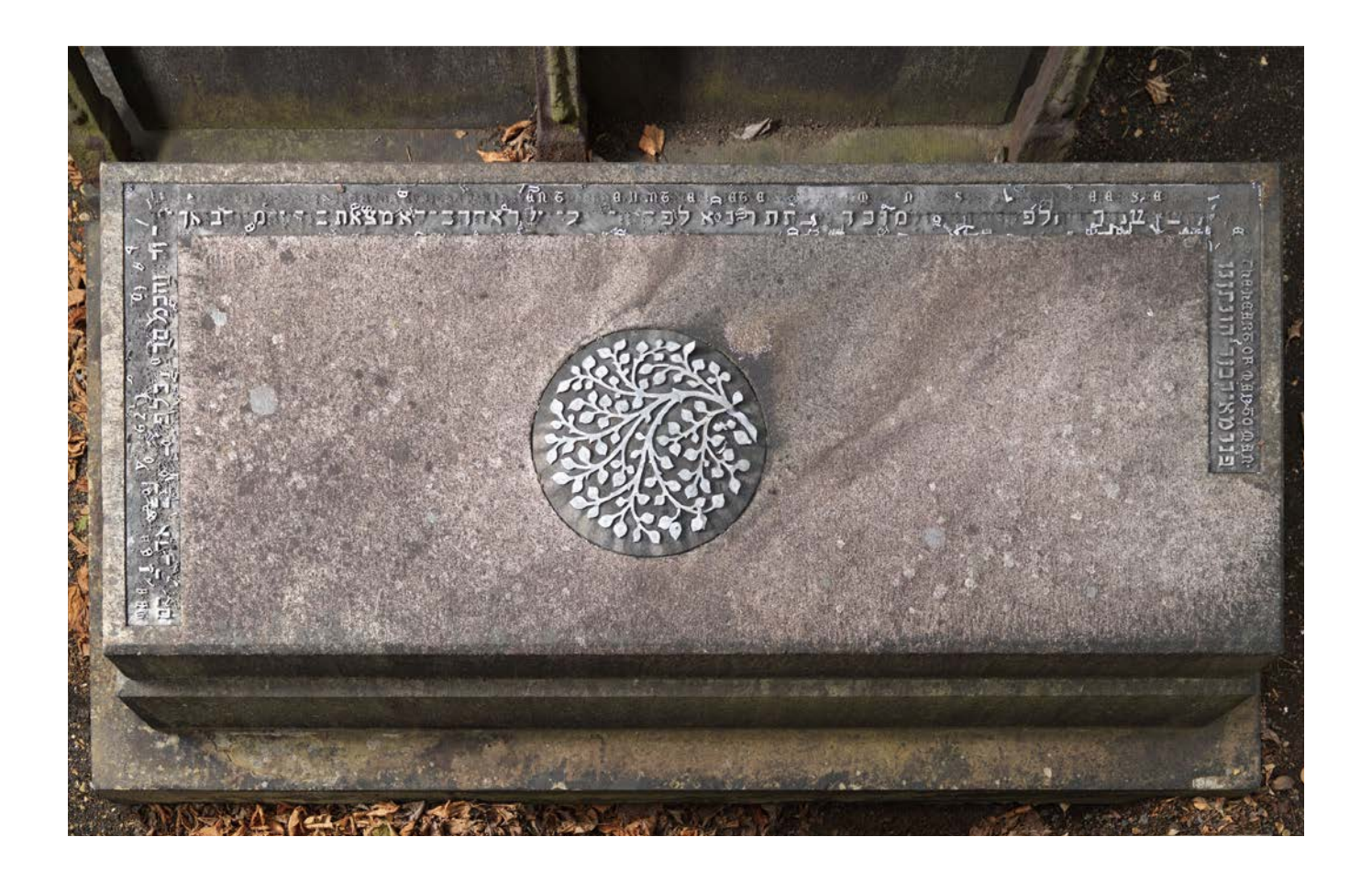
Figure 8: Tomb of Max Eberstadt (d. 1891)

Reflecting assimilation of the established Jewish community into English society, the inscriptions contain increasing amounts of English as the 19th century progresses, invariably placed below the Hebrew text. Jewish funerary images continue to be used, particularly on the graves of more recent immigrants. At Urmston cemetery, Manchester, the graves of Polish Jews display a rich array of funerary symbols more commonly seen in Eastern Europe.