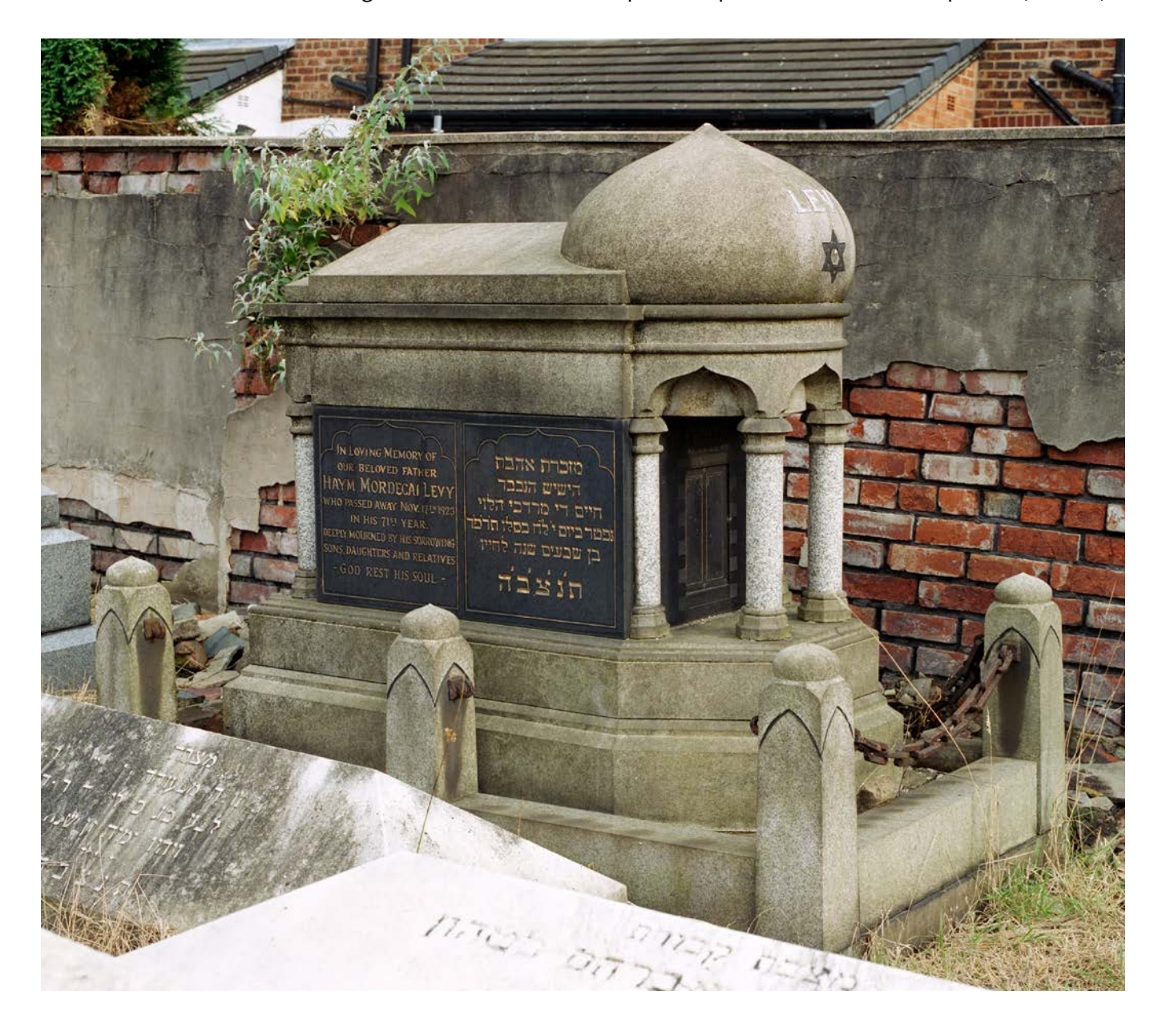
Figure 10: The grave of Haym Mordecai Levi (d.1923, Urmston Cemetery, Manchester.

Jewish tombstone design is generally conservative and 19th-century styles endured well into the 20th century, alongside simple and understated memorials. More elaborate styles included a series of distinctive domed tombs, such as that marking the grave of Haym Mordecai Levi (d.1923) in Urmston Cemetery, Manchester. Particularly interesting headstones and tombs from the 1920s and 1930s are found in Willesden's Liberal Jewish cemetery, where many refugees from Nazi-controlled Europe are buried. The Baron family tomb c1920, is a striking example of early-20th century funerary art, while a tomb in the form of a cylinder carried by tortoises, designed by Sir Edwin Lutyens, marks the grave of the celebrated Spanish opera star Conchita Supervia (d.1936).