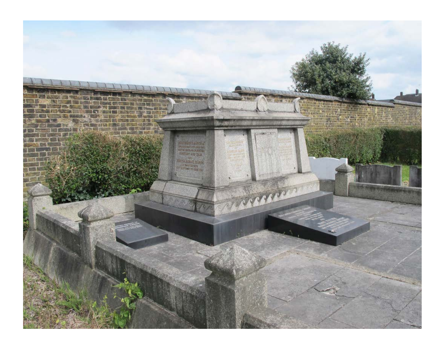
Figure 11 (top): Baron family tomb, Willesden Liberal Jewish cemetery, dating from the 1920s.