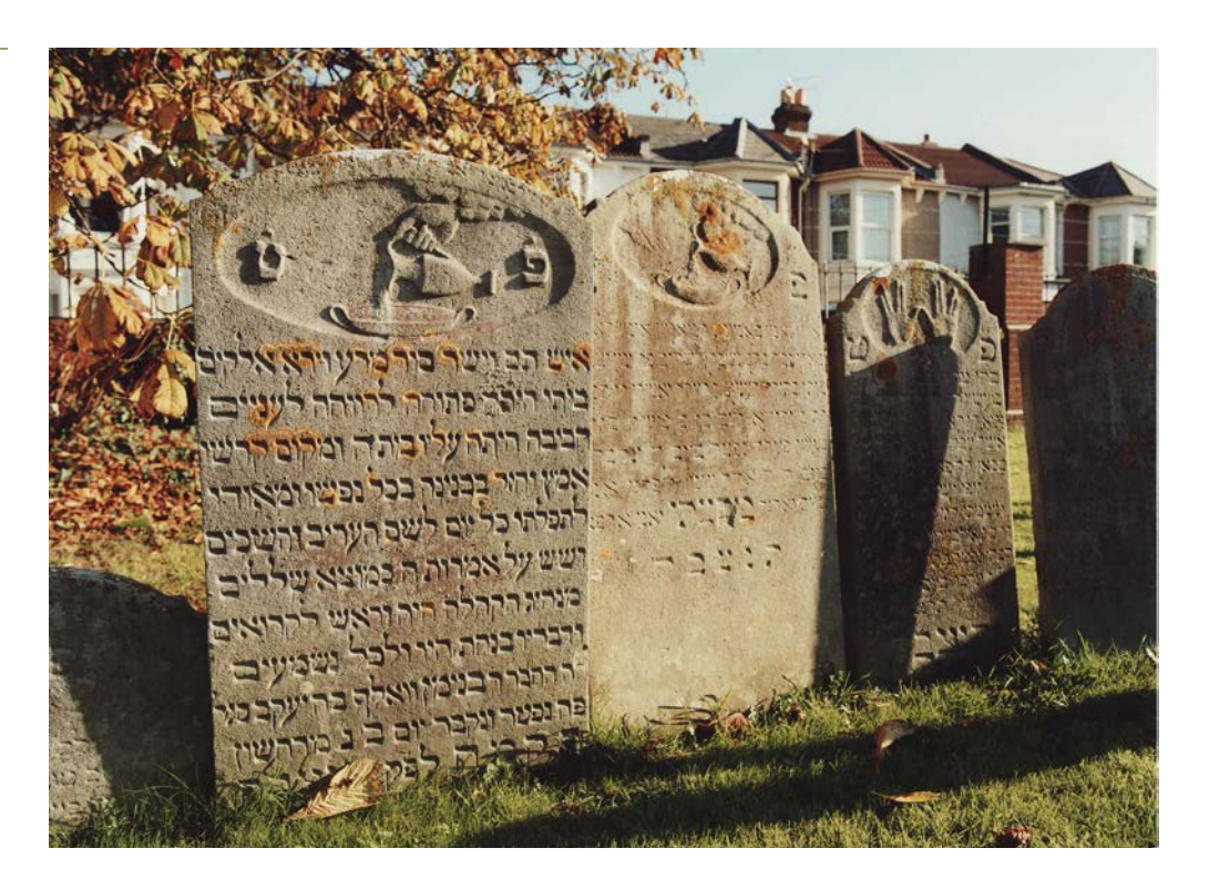
Figure 3: 18th-century headstones in Fawcett Road Cemetery, Southsea.