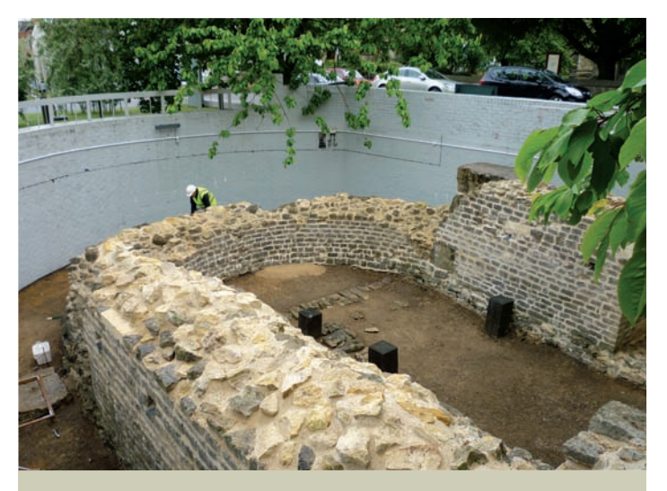
ROMAN EAST GATE, LINCOLN Repairs nearing completion at the Roman East Gate. The monument is an important reminder of Lincoln's Roman origins.