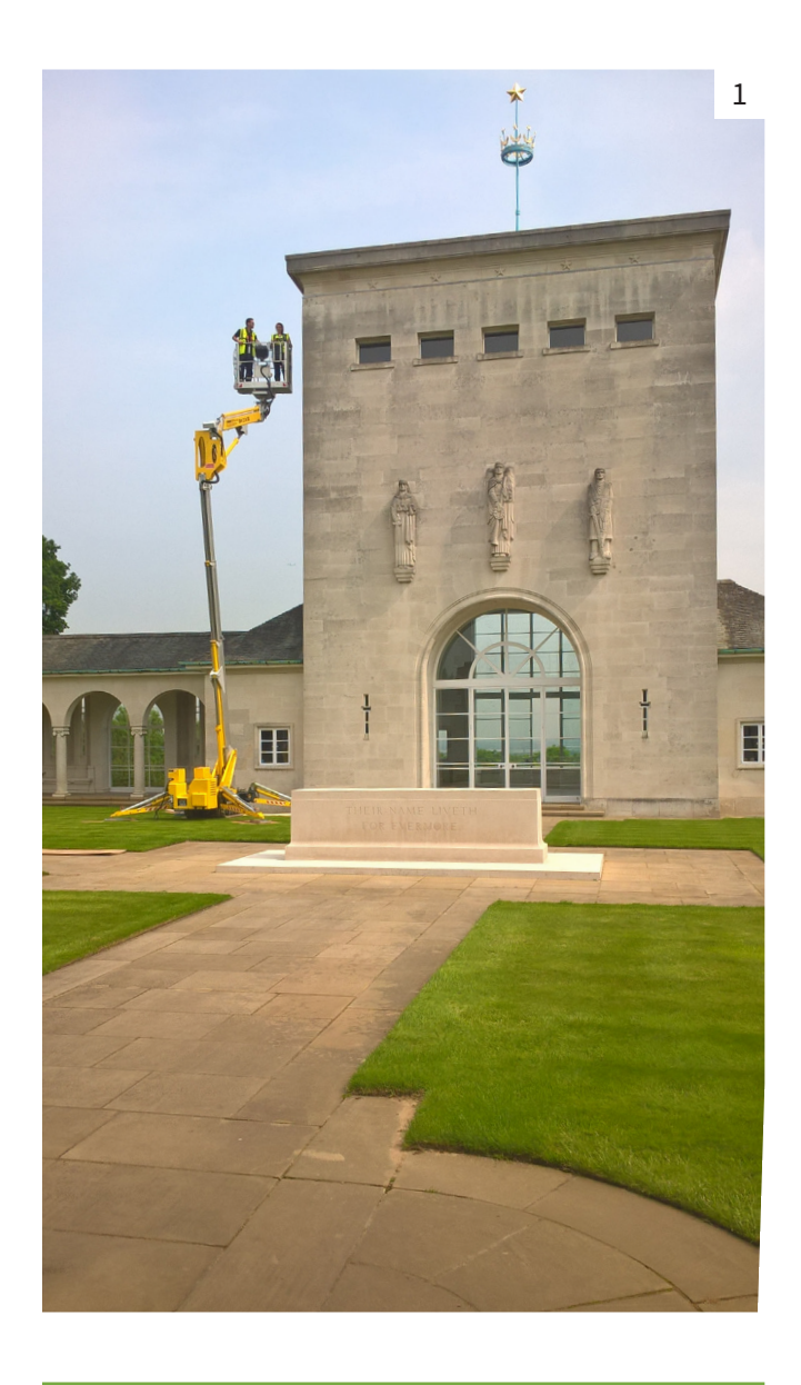
Figure 1 Access platform for inspection, Runnymede Memorial, which is in the care of the Commonwealth War Graves Commission.