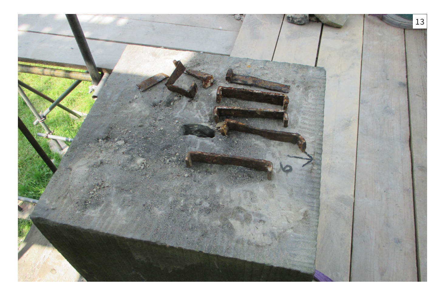
Figure 13 Corroded cramps at Waterloo Memorial, Billinge, Merseyside.