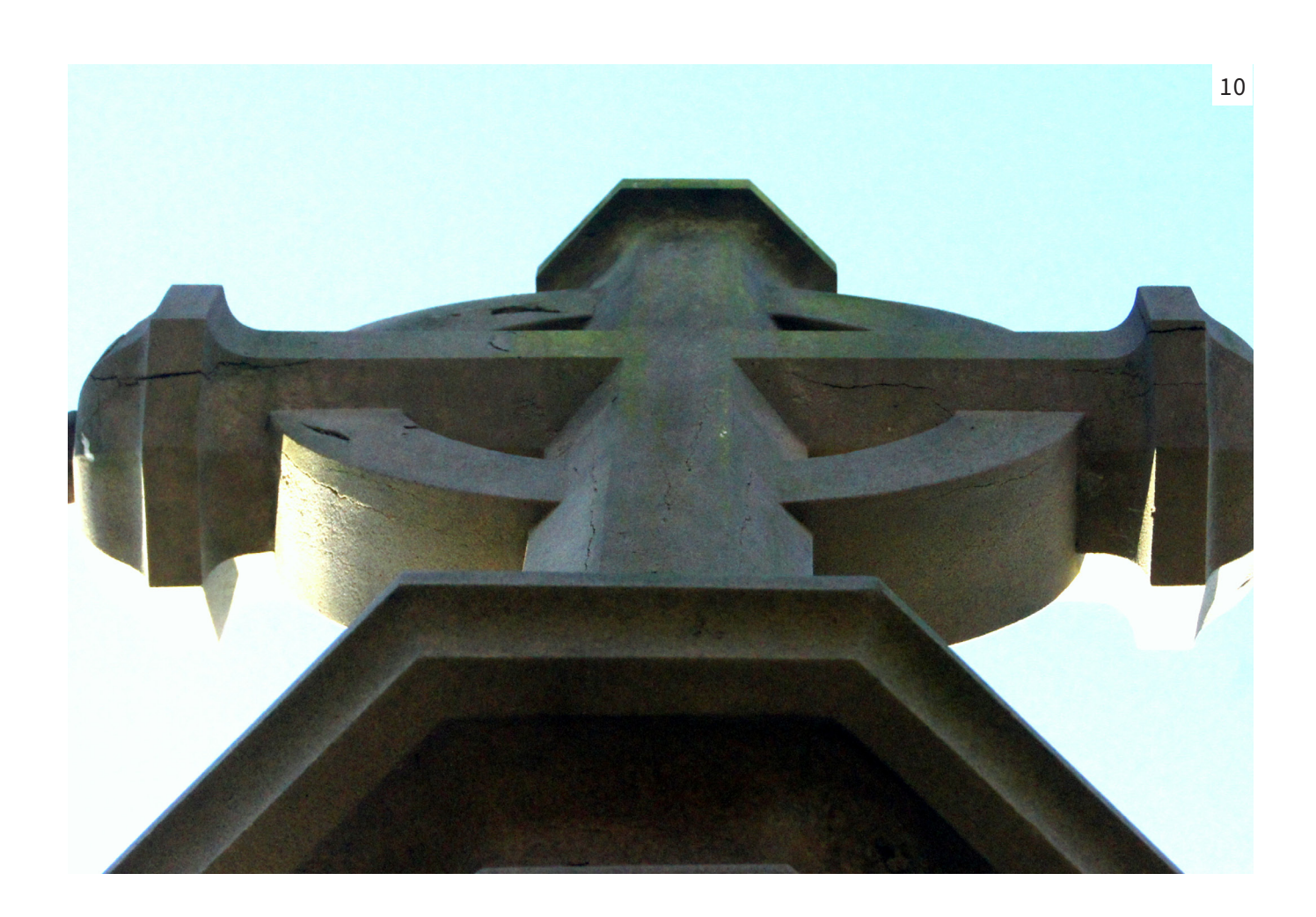
Figure 10 Cracking beyond fingertip reach recorded by telephoto lens, Southborough War Memorial, Kent.