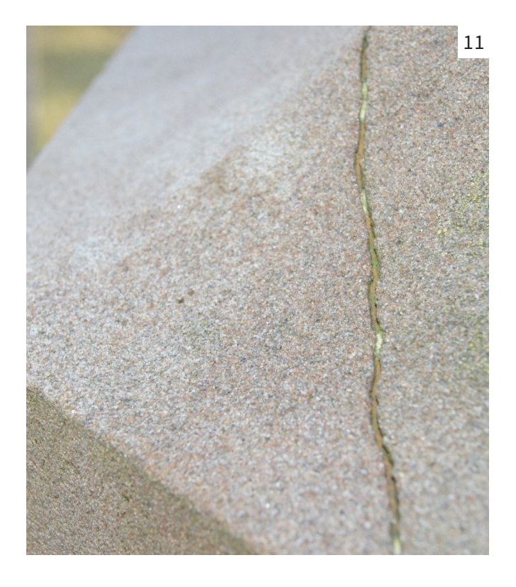
Figure 11 An old crack previously and successfully sealed with resin. Southborough War Memorial, Kent.

If the cracking is restricted to the joints, then it may be simply a matter of grouting and repointing with appropriate mortar. If the stones are cracked, and the pieces on either side have moved, then some localised dismantling and rebuilding may be required, possibly incorporating new stones to replace the cracked ones to bridge the crack. Alternatively, additional support can be given by the introduction of a helical stainless steel bar, set perpendicular to the fracture.