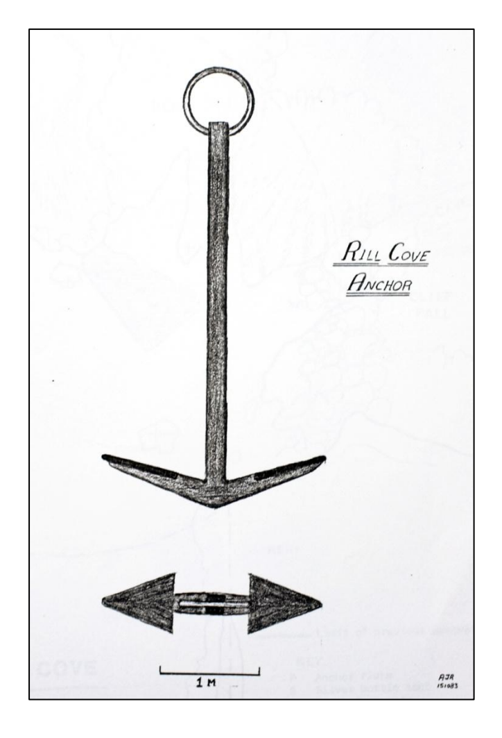
Fig 2 A straight arm anchor found about 140m south west of the site. Drawn by Anthony Randall and reproduced in the 1983 licensee's report.

No articulated ship structure has ever been reported, and indeed the finds lists show very little pertaining to the vessel itself. The only exceptions to this are (84) an anchor fluke, (75) three iron nails, (132) an iron pin or bolt and (143) a wooden pulley block – all object numbers are those used in the 1994 finds list. There is also the anchor found to the south-west of the excavated area which could be associated with the site (fig 2). In the 1983 licensee's report timber is reported - 'significant pieces of timber were ... found' - but no further details were given and the timber does not appear on any of the surviving site plans or finds lists.