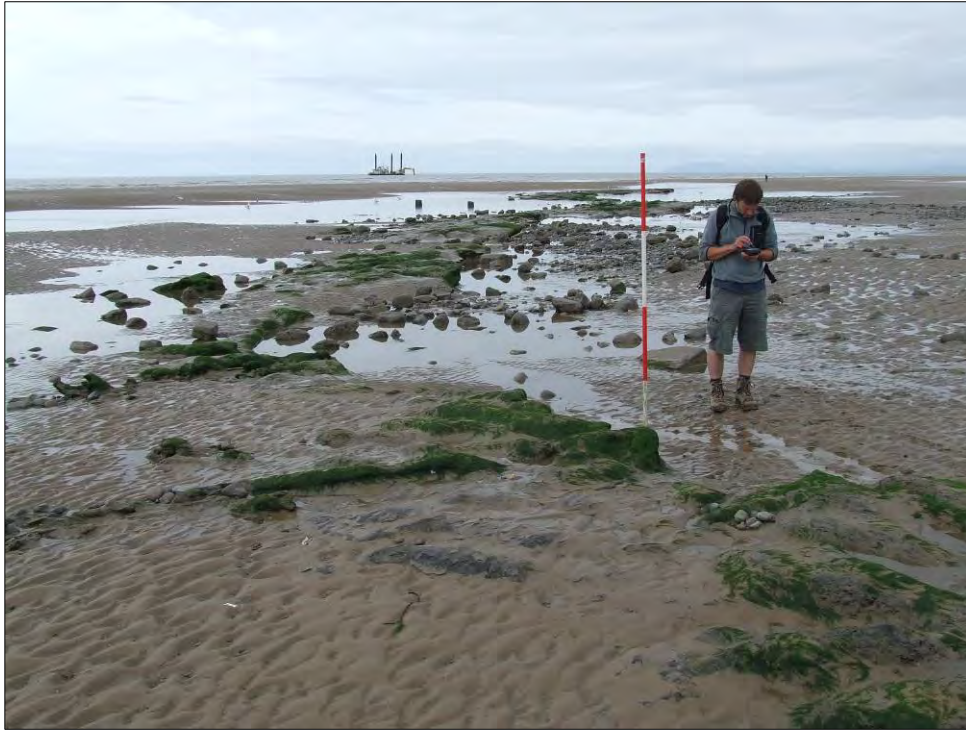
Figure 1.2 Survey in progress at exposed inter-tidal peat bed at Cleveleys, Lancashire (scale = 2m).