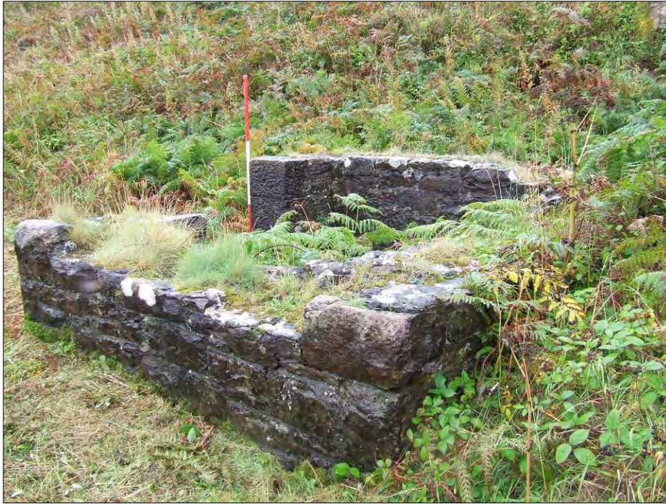
Figure 1.5 Structural remains at Barrowmouth Alabaster and Gypsum Mine, Cumbria (scale = 0.5m graduations).

Where significant organic deposits such as these were identified in association with archaeological remains, an environmental sampling programme was undertaken. This was the case most notably at Drigg where suspected burnt mounds are found in association with a distinctive band of peat and organic material. These were recorded and sampled as part of the palaeoenvironmental element of the project, whilst the suspected burnt mounds were recorded in the archaeological assessment.