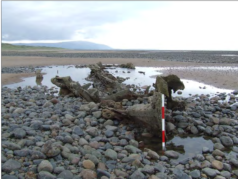
Figure 1.1 Wreck / gunnery target recorded on the foreshore at Drigg, Cumbria (scale = 1m).

The detailed location reports summarise the archaeological features recorded at each site and assess the threats that they face with reference to current SMP2 policy. This information is compiled in Chapters 2-5 of this report. These chapters cover each of the fifty sites surveyed, being subdivided into Cheshire, Merseyside, Lancashire, south Cumbria and north Cumbria.