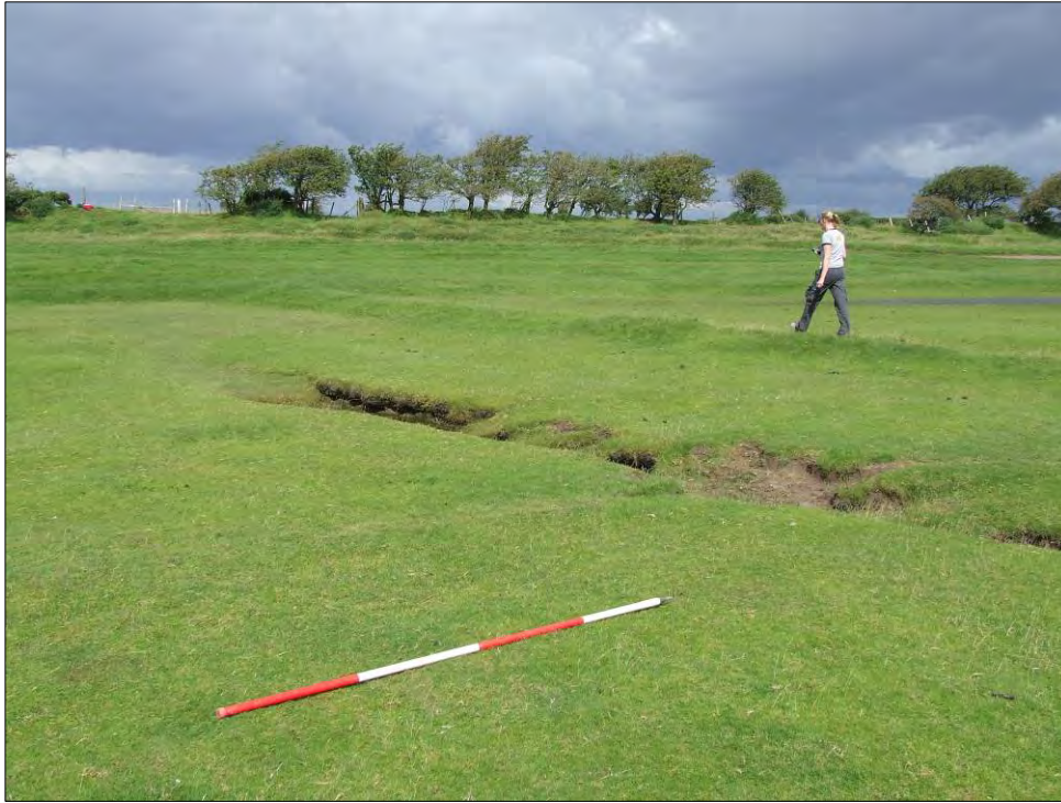
Figure 1.4 Handheld GPS survey in progress on the earthwork remains at Skinburness, Cumbria (scale = 2m).

display in the field to identify previously known earthwork remains, some of which were then re-interpreted (Figure 1.4). The field survey recorded all earthwork remains encountered using mapping grade GPS in basic plan form utilising lines and polygons where appropriate in accordance with Level 2 survey (Ainsworth et al. 2007). If earthwork sites had already been recorded as part of a recent detailed Level 3 survey, for example Cockersand Abbey (Burn et al. 2009), then they were recorded as a point with an attached condition statement, rather than in detail, to avoid repetition of survey work.