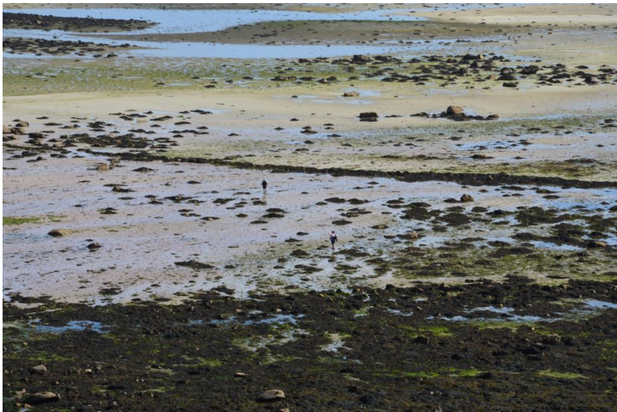
Samson Flats submerged prehistoric field system, Isles of Scilly, UK.