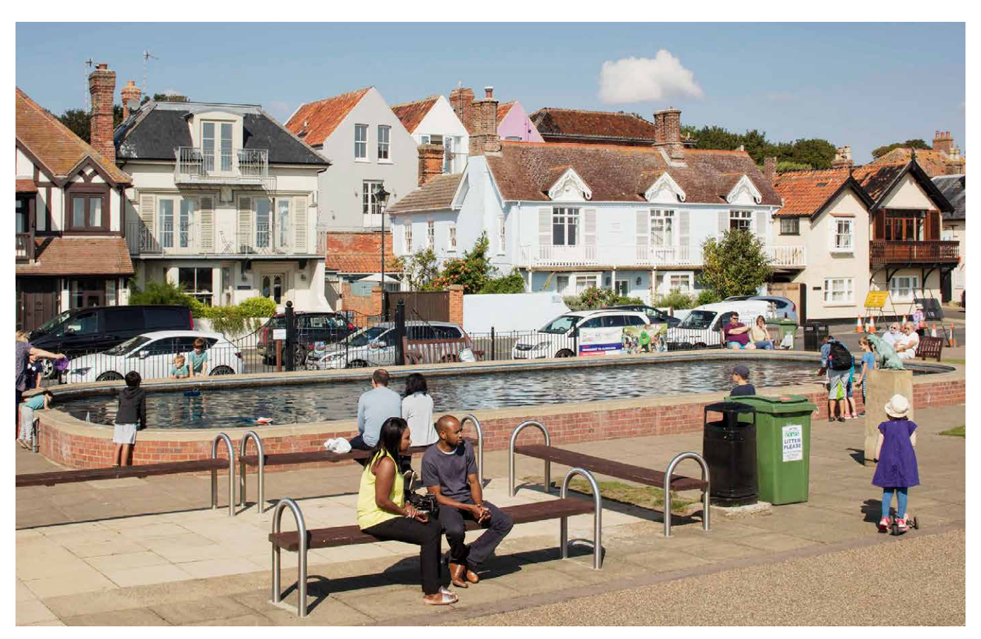
Aldeburgh, Suffolk. Well-designed modern paving and street furniture are sometimes a better choice for historic areas than off-the-shelf 'heritage' solutions.

Pedestrians and drivers in Suffolk and Norfolk's historic towns and villages have benefited in recent years from the traffic-calming policies advocated by their county councils, but some other highway authorities have been slower to move away from the notion that 'keeping the traffic moving' is all that matters.