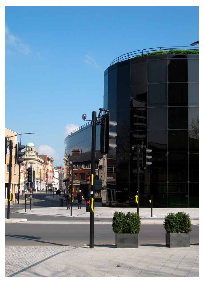
Ipswich, Suffolk. High-quality paved surfaces, discrete planters and a minimum of clutter give this important civic space a sense of orderly calm.

Streets that are safe and attractive places for people to live and work need to be the rule, not the exception. That's why good design needs to be at the heart of the East of England's cities, towns and villages.