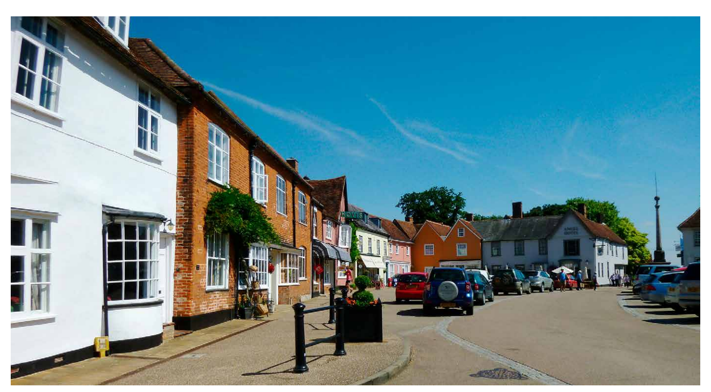
Lavenham, Suffolk. The discrete use of bollards, planters, widened footways and demarcated parking areas have together helped to enhance the visual character of this popular tourist destination.

It begins by identifying the elements that make an area distinctive – its landscape, the form and layout of its historic places, as well as its building materials and traditional detailing. It then addresses some of the common problems that can diminish the quality of public areas and explains how integrated townscape management can provide answers.