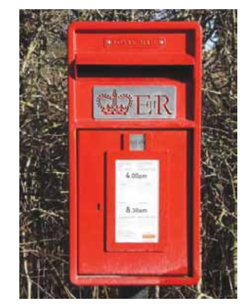
One of the newest design lamp boxes from Aberbechan.

or other appropriate local institution, exhibited at local Royal Mail premises, or offered to The Postal Museum.