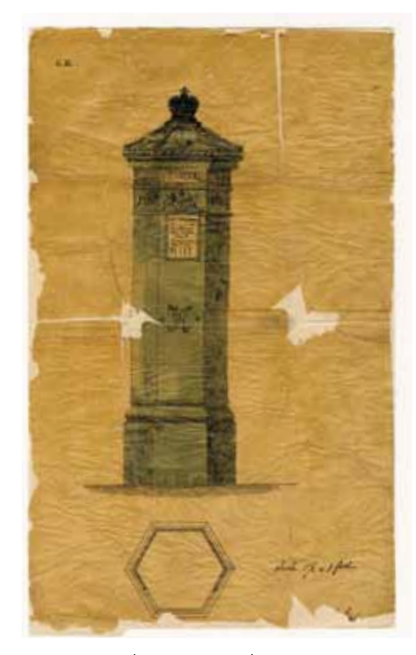
1864 design (later adapted) by J.W. Penfold for a standard pillar box for the whole country. POST 30/173B.

The novelist Anthony Trollope, a General Post Office (GPO) official sent to Jersey to make recommendations, provided a solution. He adopted a system used on the Continent of placing locked cast-iron pillar boxes at the roadside and the provision of regular collection times. His scheme began in the Channel Islands in 1852 and was extended to the mainland in 1853. Since these Victorian