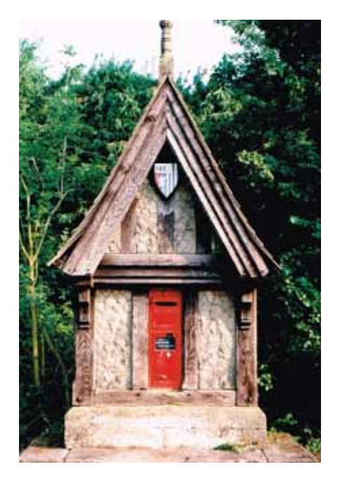
VR 1870s wall box. This splendid edifice, looking like a wayside shrine, was built by a local parson.

local institution, exhibited at local Royal Mail premises, or offered to The Postal Museum; or offered as a source of spare parts to Royal Mail engineers. In all cases the keys should be retained with the box so wherever possible the lock, as fitted, is retained in operational use. In all cases Royal Mail should prepare appropriate paperwork which identifies the provenance of the box and verifies the legitimate nature of its decommissioning.