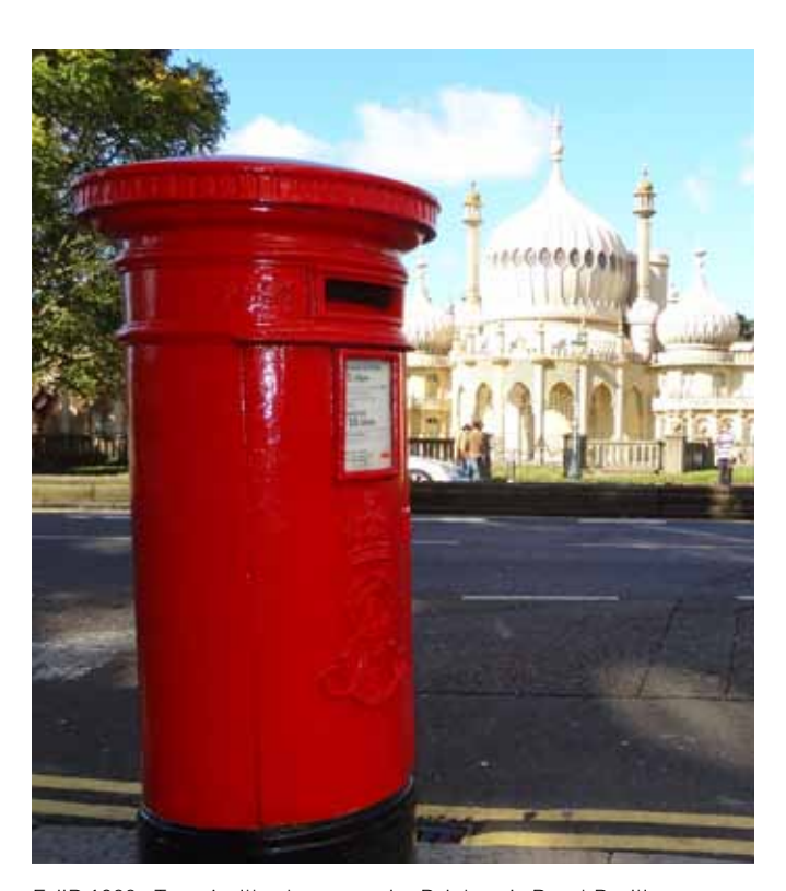
EviiR 1900s Type A pillar box opposite Brighton's Royal Pavilion.