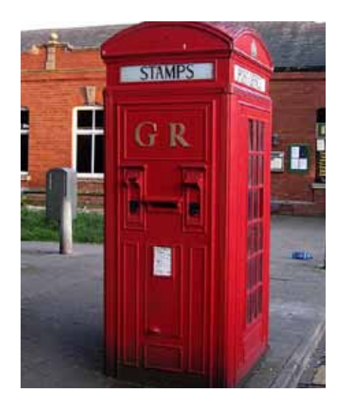
GR 1930s pillar box. A 'K4 Vermillion Giant': a telephone kiosk, a post box and two stamp vending machines combined. This one is in Whitley Bay.

intrinsically linked to the cultural heritage of the host community.