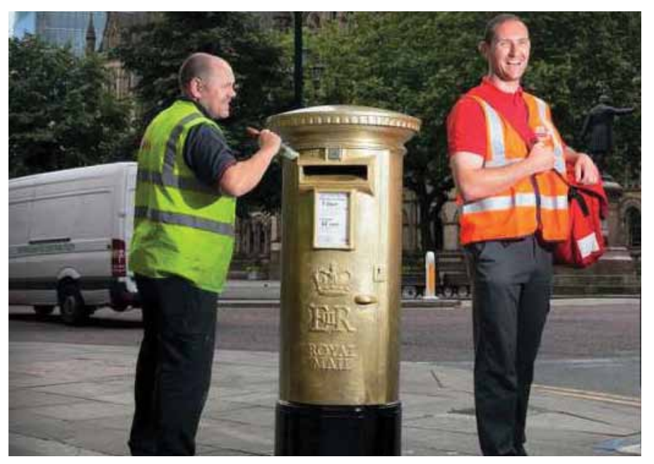
Gold post box to celebrate Philip Hindes' Men's Cycling Team Sprint gold medal at the London 2012 Olympic Games.