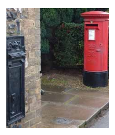
E2R 1990s pillar box and decommissioned GR wall box. Boxes should be painted black and sealed if they are taken out of service but remain in situ, as this one near Bury St Edmunds.

protection from rainwater. This standardised design of 1859 was itself soon followed by a variety of new designs, notably the elegant hexagonal box, first seen in 1866, with a cap decorated with acanthus leaves designed by JW Penfold.