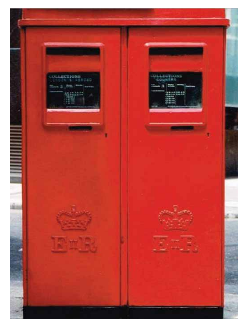
EiiR 1970s pillar boxes. A pair of Type G pillar boxes; a development of an earlier 1968 design of square pillar box by David Mellor.