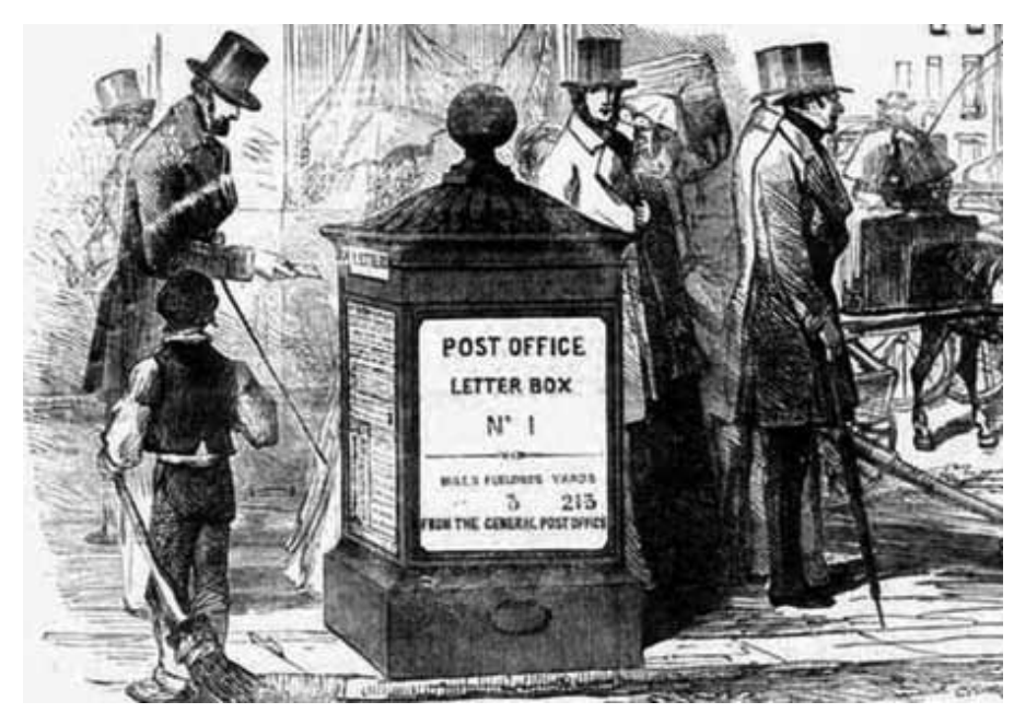
VR 1855 pillar box. Box Number One, London's first pillar box, was erected three years after Trollope adopted the concept from France. Illustrated London News. POST 118/2114. © The British Postal Museum & Archive, 2015