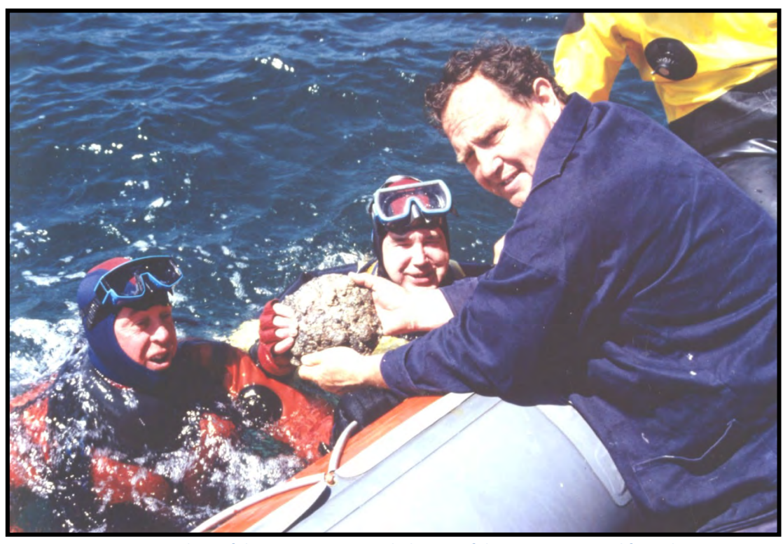
Members of the SWMAG team with the one of the ingots recovered from the site

Prepared for Historic England January 2018