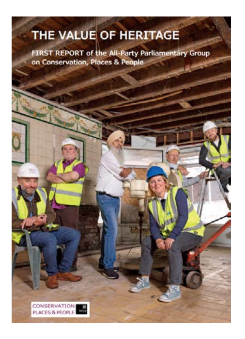
Image: Front cover of The Value of Heritage Report, showing people onsite at Tyldesley High Street Heritage Action Zone, Lancashire.

In addition, the APPG heard extensive evidence about how heritage can help to provide the glue which bind communities together and help to foster stronger local identity.