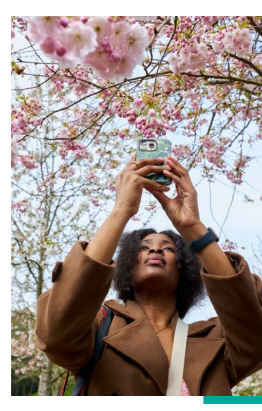
Image: A visitor photographing blossom at Cliveden, Buckinghamshire.

to 'turn back the clock', but instead to raise awareness and prompt discussion about the future of our landscapes and how we might seek to incorporate the beauty, nature, and history of orchards in that future. Research themes in the National Trust's 2023 Blossom campaign include place names and hedgerows.