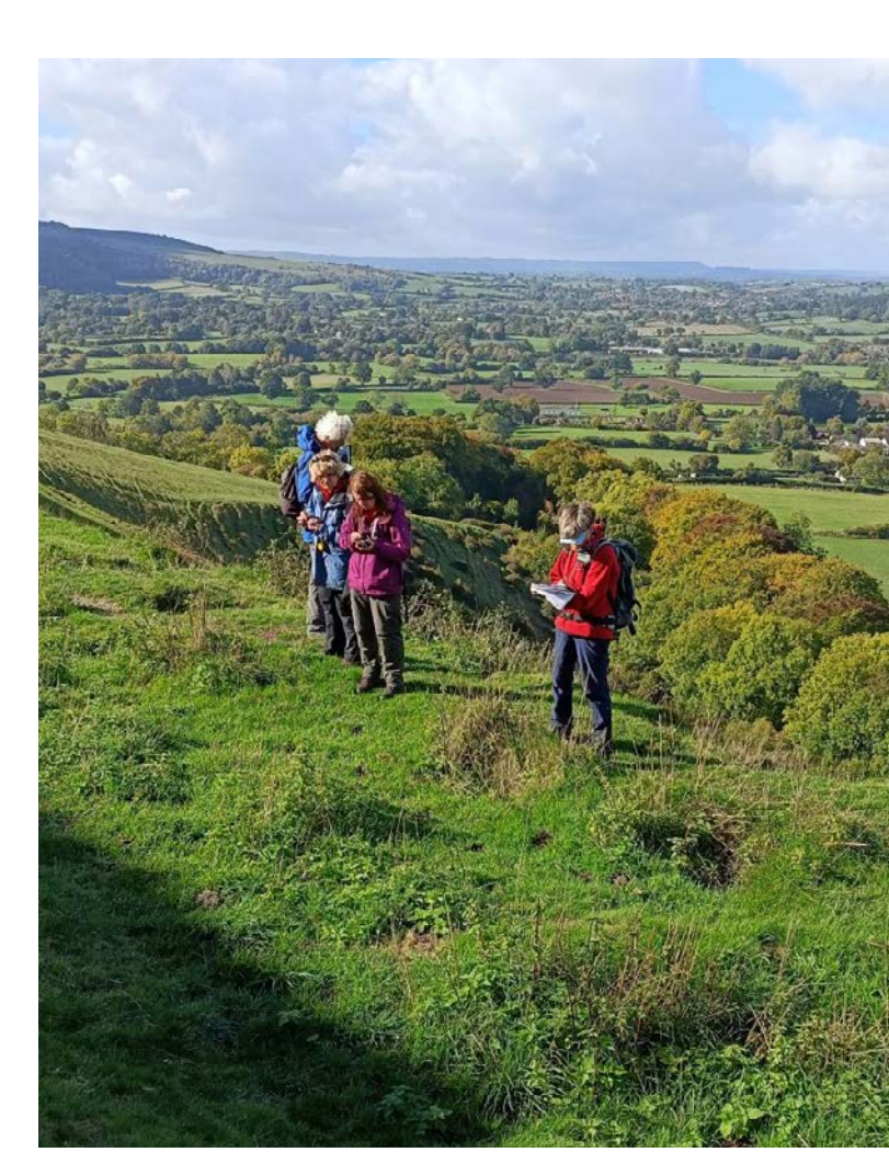
Image: The North & East Dorset HART undertook baseline survey of a number of hillforts to inform the management works undertaken under the Hillforts and Habitats project and are now returning as part of a programme of regular cyclical of condition monitoring.

As the volunteers themselves say "The joy comes from being with like-minded people in such special places with spectacular views, hearing the skylarks, admiring the cowslips and feeling we are doing something worthwhile." (North & East Dorset HART). The Trust's current objective is to roll out HART so that all of its places benefit from the invaluable support that these volunteers contribute.