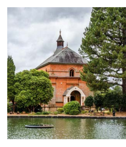
Image 1: Tyldesley High Street Heritage Action Zone.

historic buildings and places that we have inherited from previous generations. Our Heritage at Risk programme is a key contributor to this ambition. With the help of local communities and partners, imaginative thinking and business planning, we can bring historic places back to life."