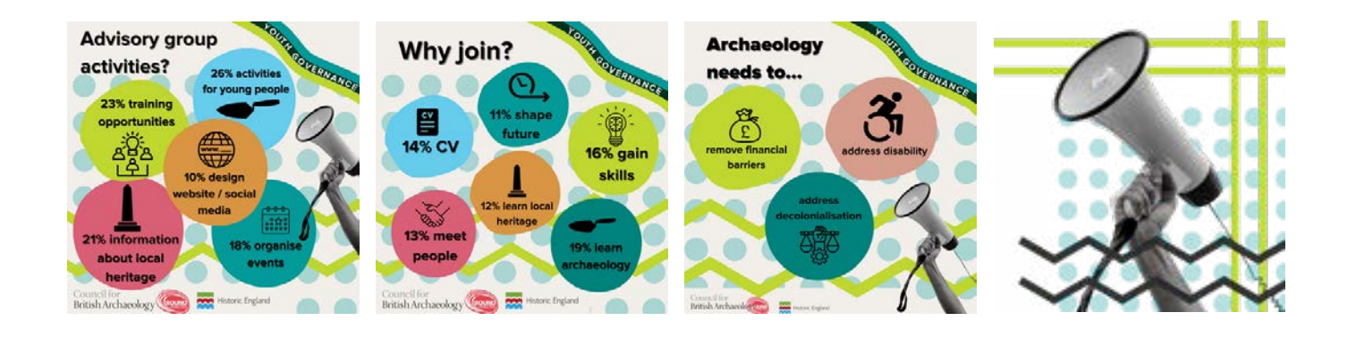
Image 1: List of suggested activities the YAG should undertake based on results of the CBA's Youth Consultation in 2022.

Thanks to funding from Headley Trust, the CBA will be welcoming a new member of staff to lead the day-to-day delivery of this strand of work for the next two years. Funding from Historic England has also provided the opportunity to develop a sixmonth training course for staff, stakeholders and new Youth Advisory Group members, delivered by sector specialist, Participation People, and their own cohort of youth consultants. The initiative will also coach staff on facilitating a youth governance programme and supporting young people during the process.