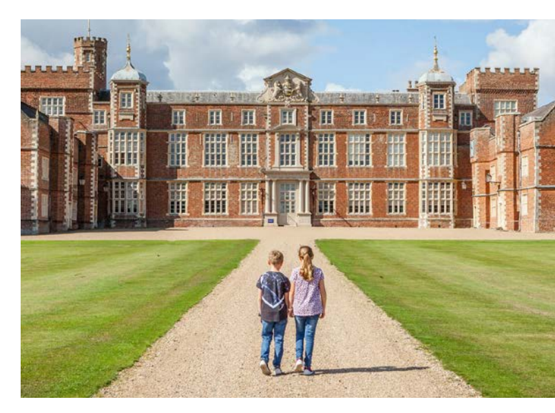
Image: Children outside Burton Constable Hall & Grounds, a Historic Houses member property.