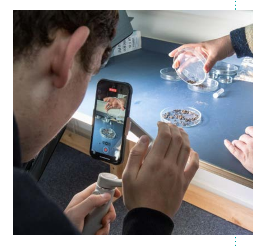
Image: 15 year old entrepreneur at work, briefed with creating a '60 seconds Science' film about archaeobotany. Organised as part of the community engagement work contracted by the National Highways scheme for the improvement to A428, delivered by the Public Value Team.

A key message from this work is that collaborations should begin at the start of project designs, with the premise that all voices are equally valuable in terms of delivering social and environmental benefits. Language and communication are at the heart of better understanding how the archaeology profession can level existing planning and other policy frameworks to enable sustainability. As a start, this involves addressing impacts on society and the environment, and enabling the delivery of an ethical archaeological practice.