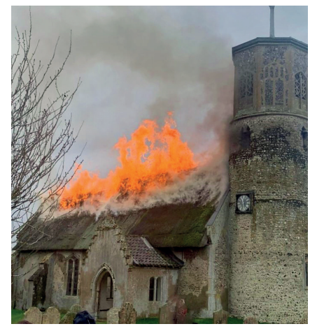
A spark from welding caused the blaze at St Mary's church in Beachamwell, Norfolk

A guidance book and design and installation details on how best to protect a church or any historic building from damage can be found on the Historic England webpages, along with a recording of the Historic England 'Technical Tuesday' webinar on this topic (see http://bc-url.com/hc23-gf1).