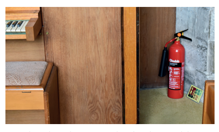
A carbon dioxide extinguisher for electrical fires stationed next to the organ in St Mary's, Tisbury