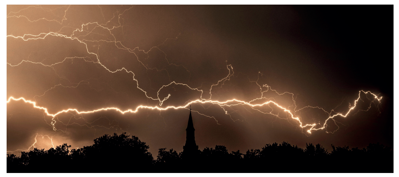
Lightning above a rural church