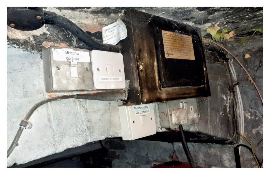
A smoke-blackened consumer unit in the parish church of Bibury, Oxfordshire